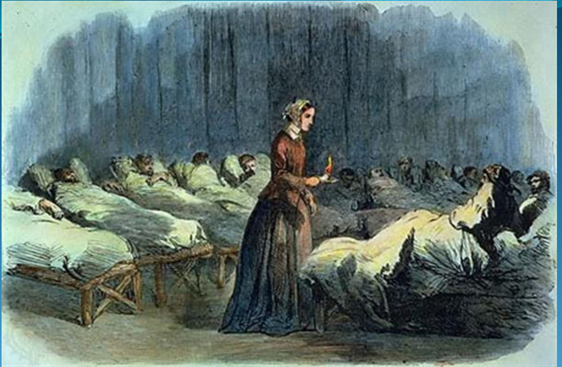
The Lady with the Lamp