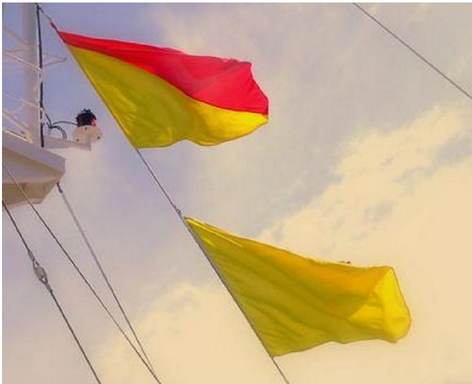
Signal flags "OSCAR" over "QUEBEC" - Denotes swinging the ship