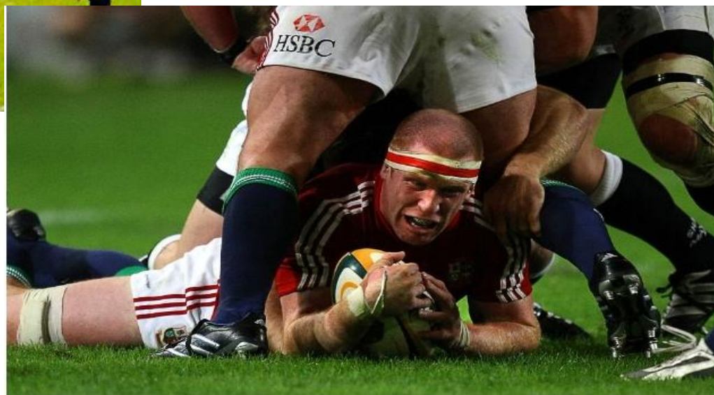
23) Капитан британско-ирландской команды «Lion» Пол О'Коннелл держит мяч во время матча по регби против южно-африканской команды «Sharks» в Дурбане 10 июня.