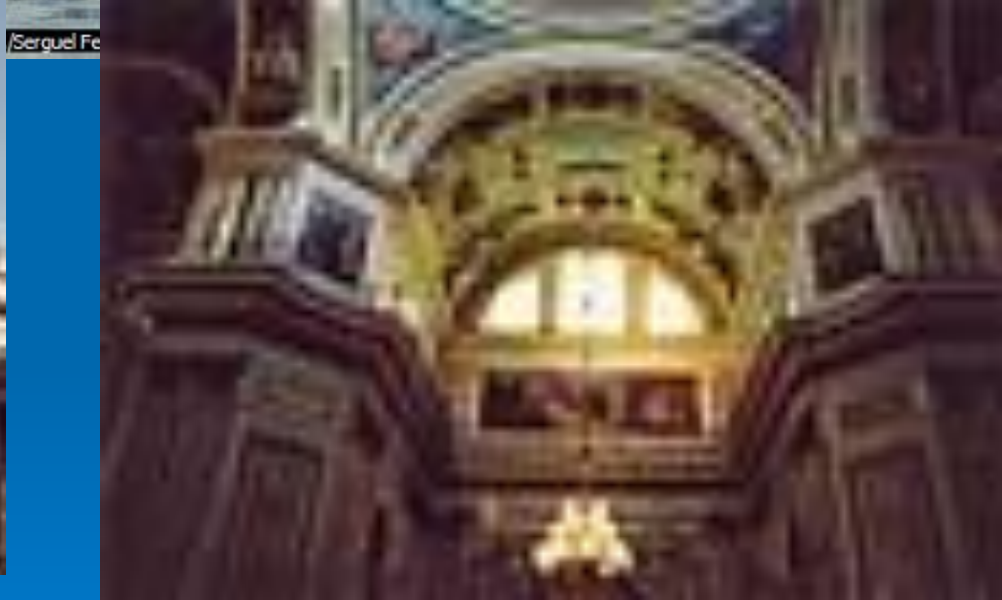
The Saint Isaac's Cathedral