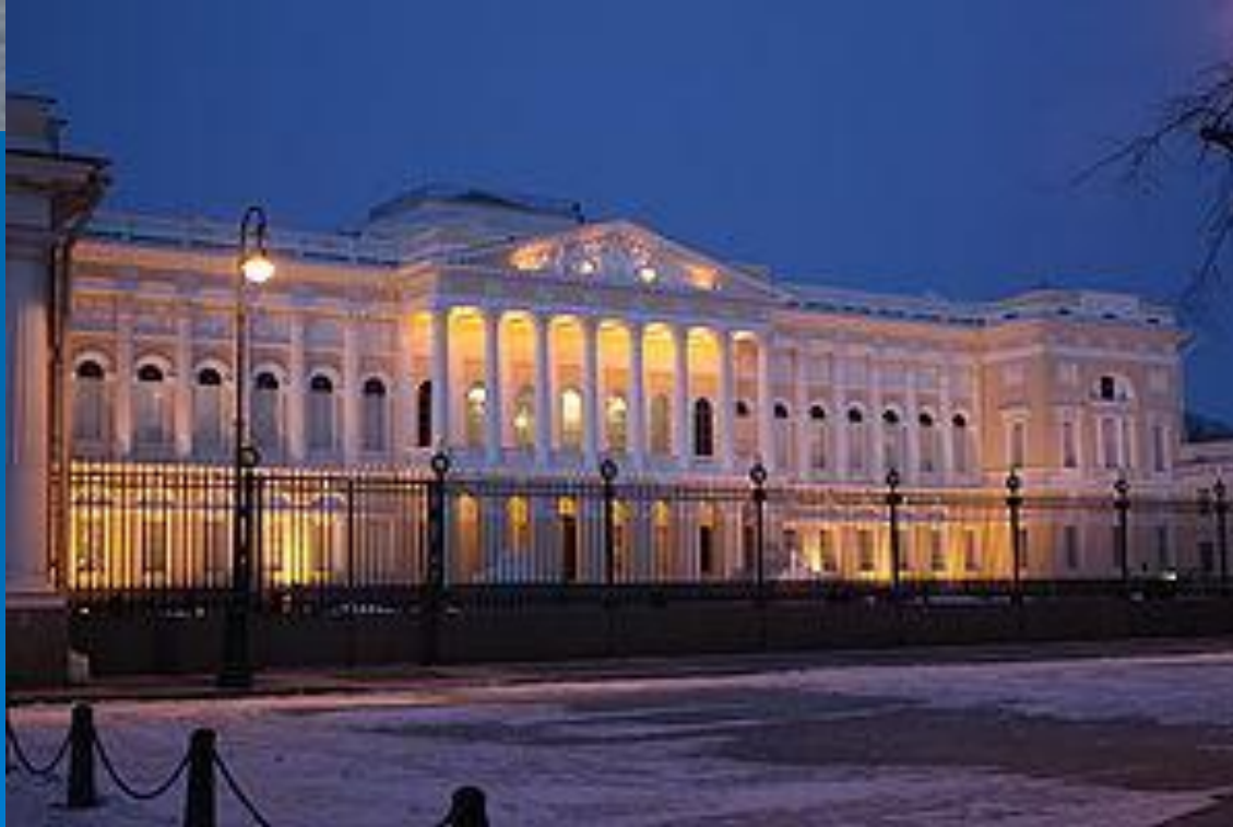
The Russian museum