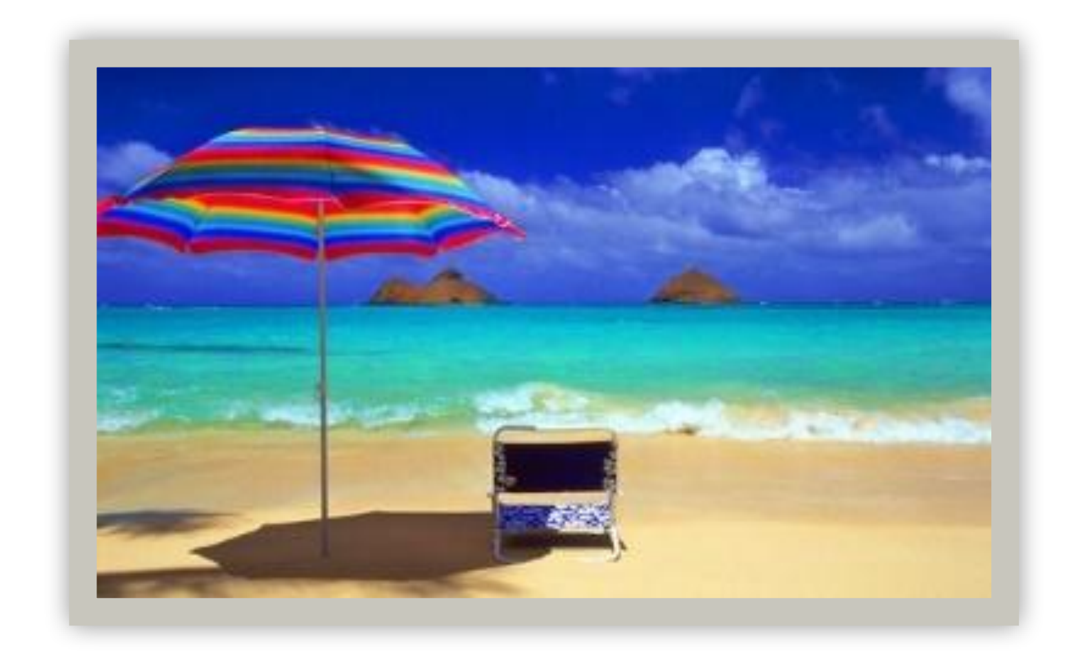
The weather in Sydney is fantastic. It's warm and sunny.