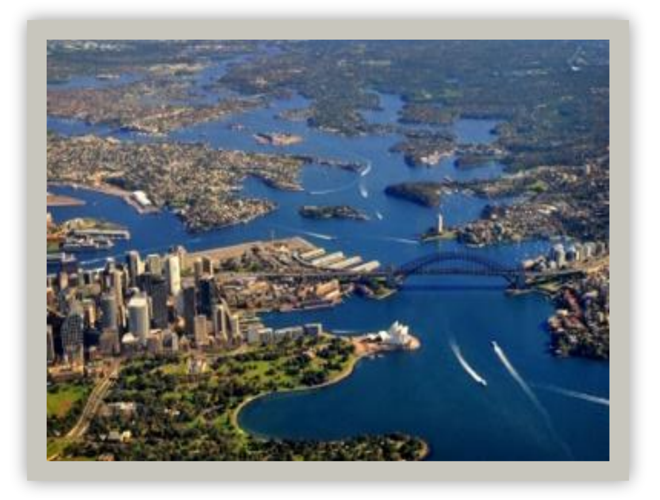
Sydney is a beautiful city