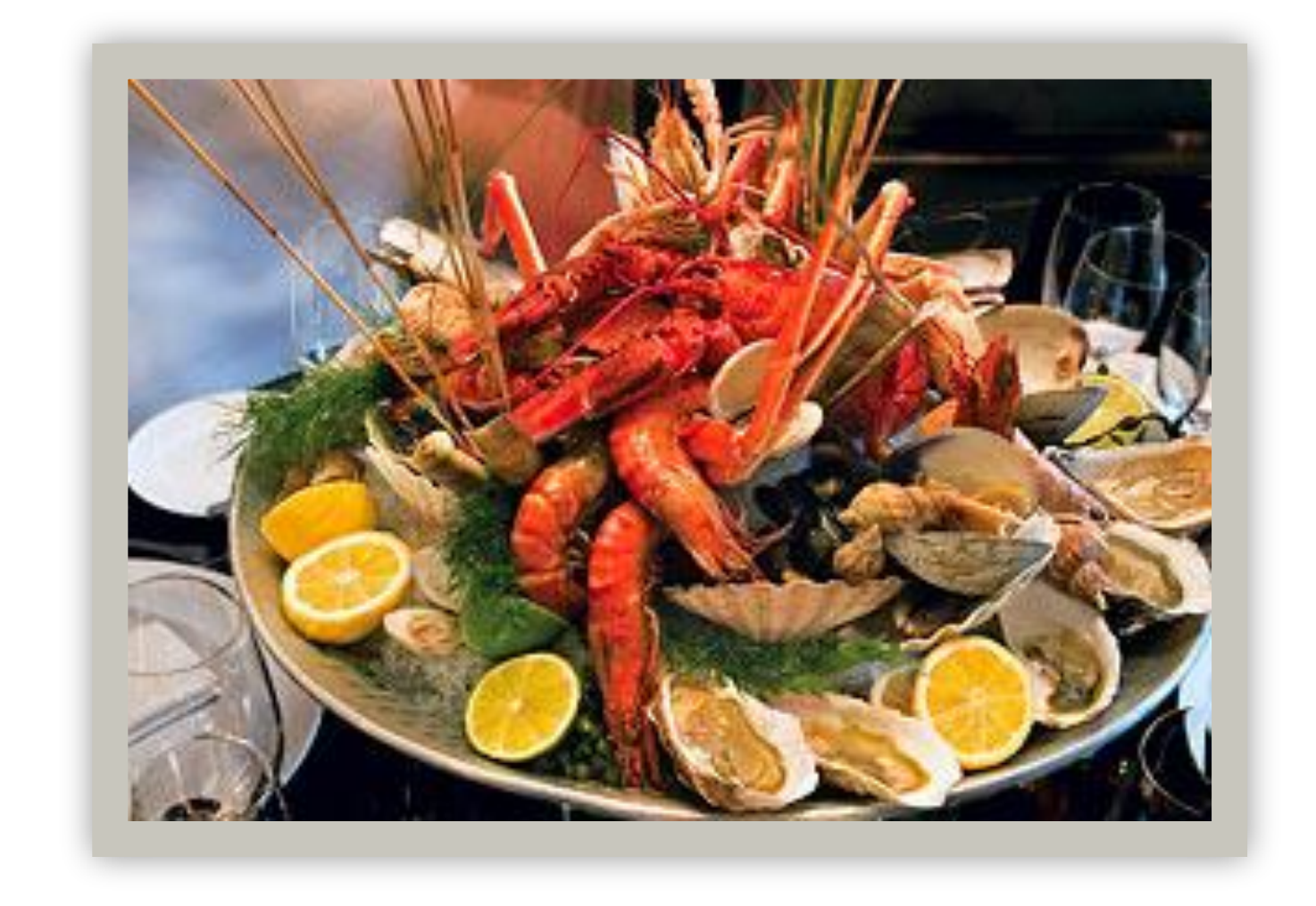
...and the food is delicious