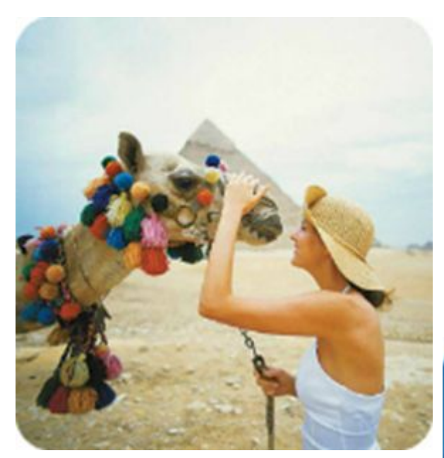
Task 3. Imagine that while travelling during your holidays you took some photos. Choose one photo to present to your friend.