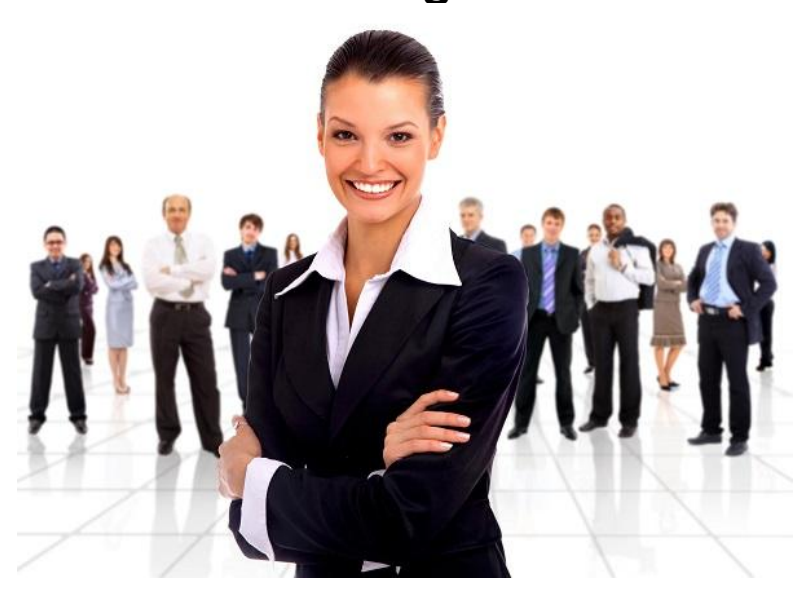
Is put into practice in the whole organization