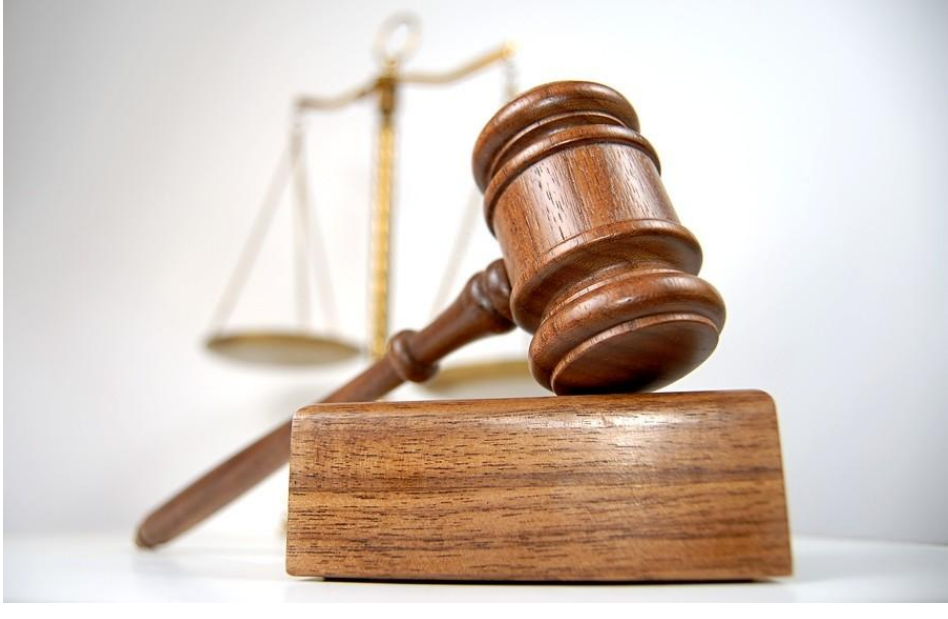
Corresponds to our and International legislation