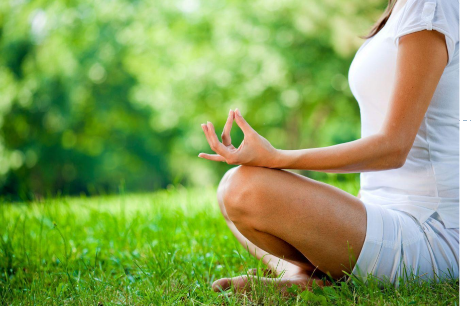
Prosperity of our society including health