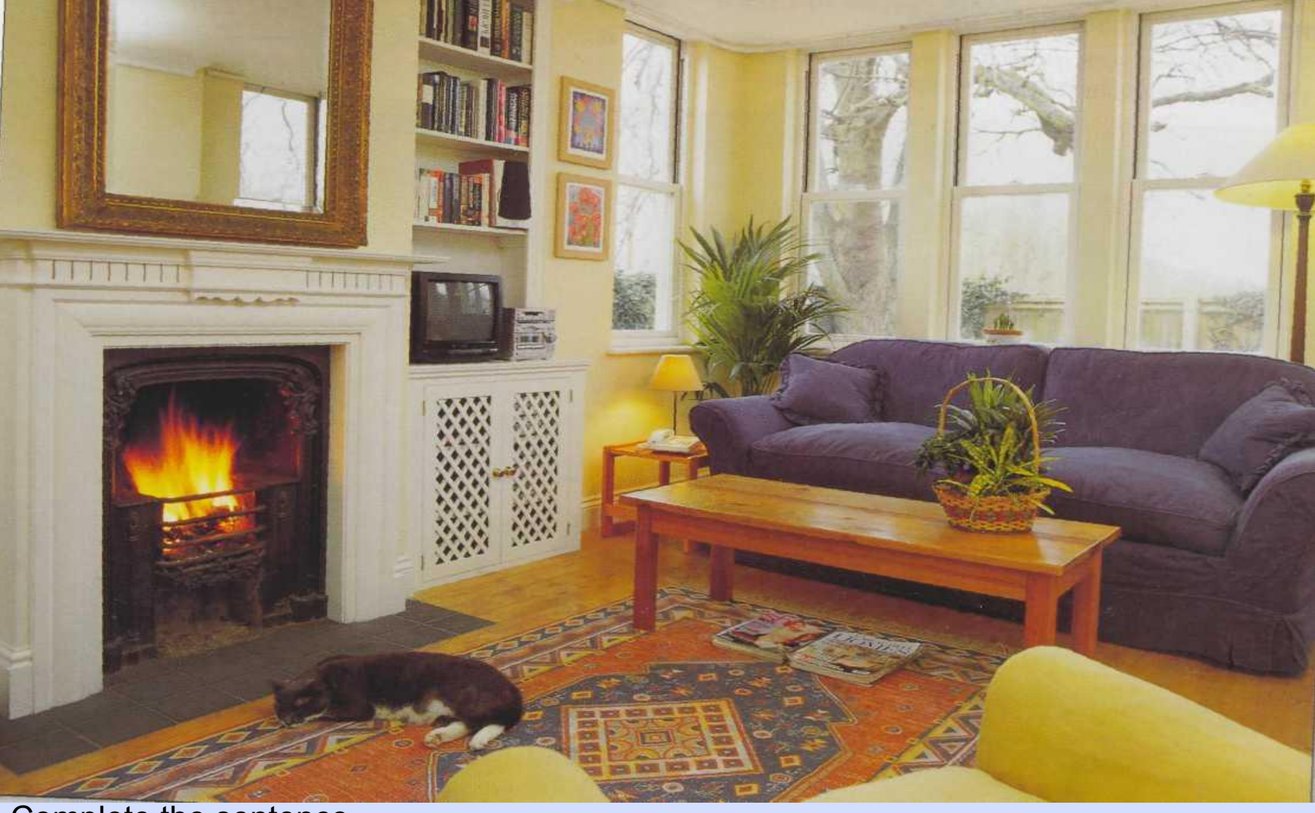
Complete the sentence

My living room is not very big, but I love it. There is a sofa and there are two armchairs.