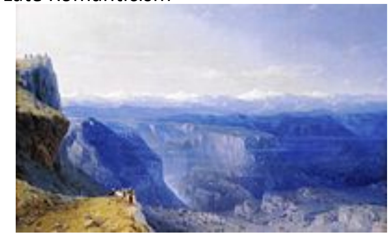
Ivan Aivazovsky, 1863, The Caucasus. Late Romanticism