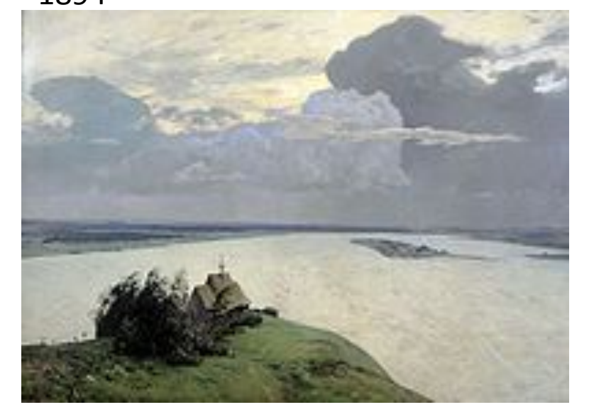
Isaac Levitan, Above Eternal Peace, 1894