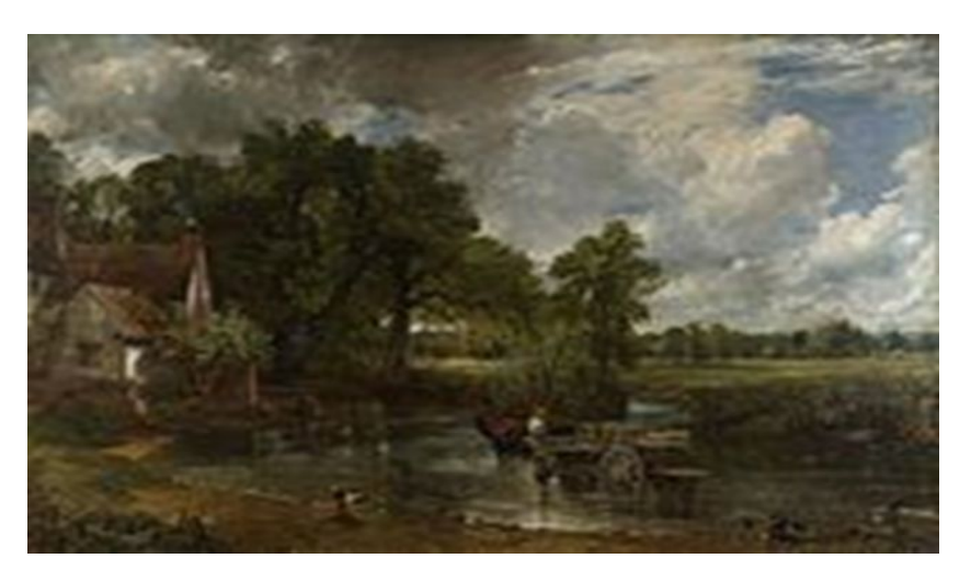
John Constable, 1821, The Hay Wain. Early Romanticism