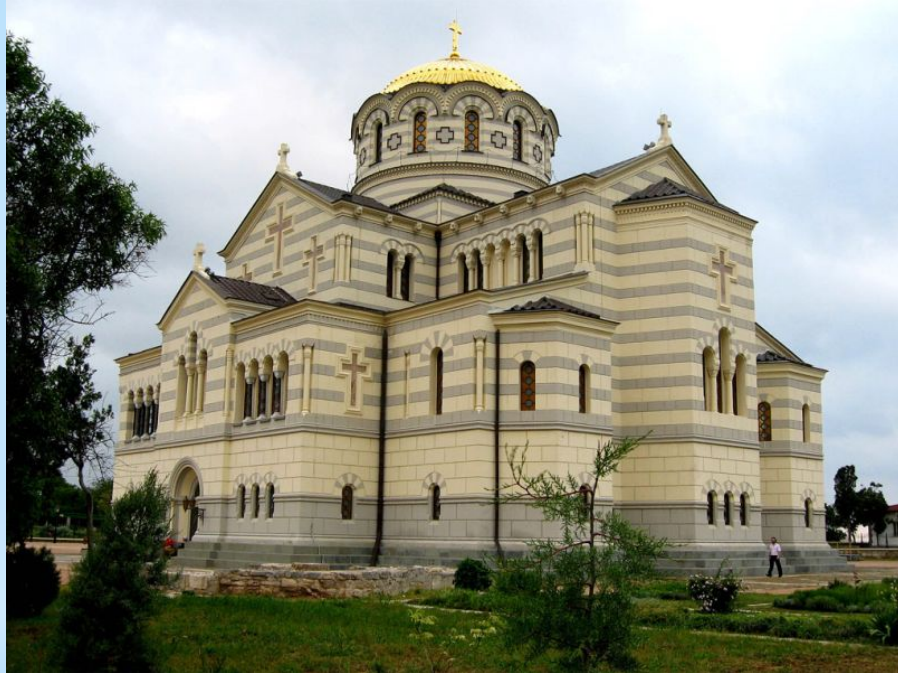
St. Vladimir's Cathedral