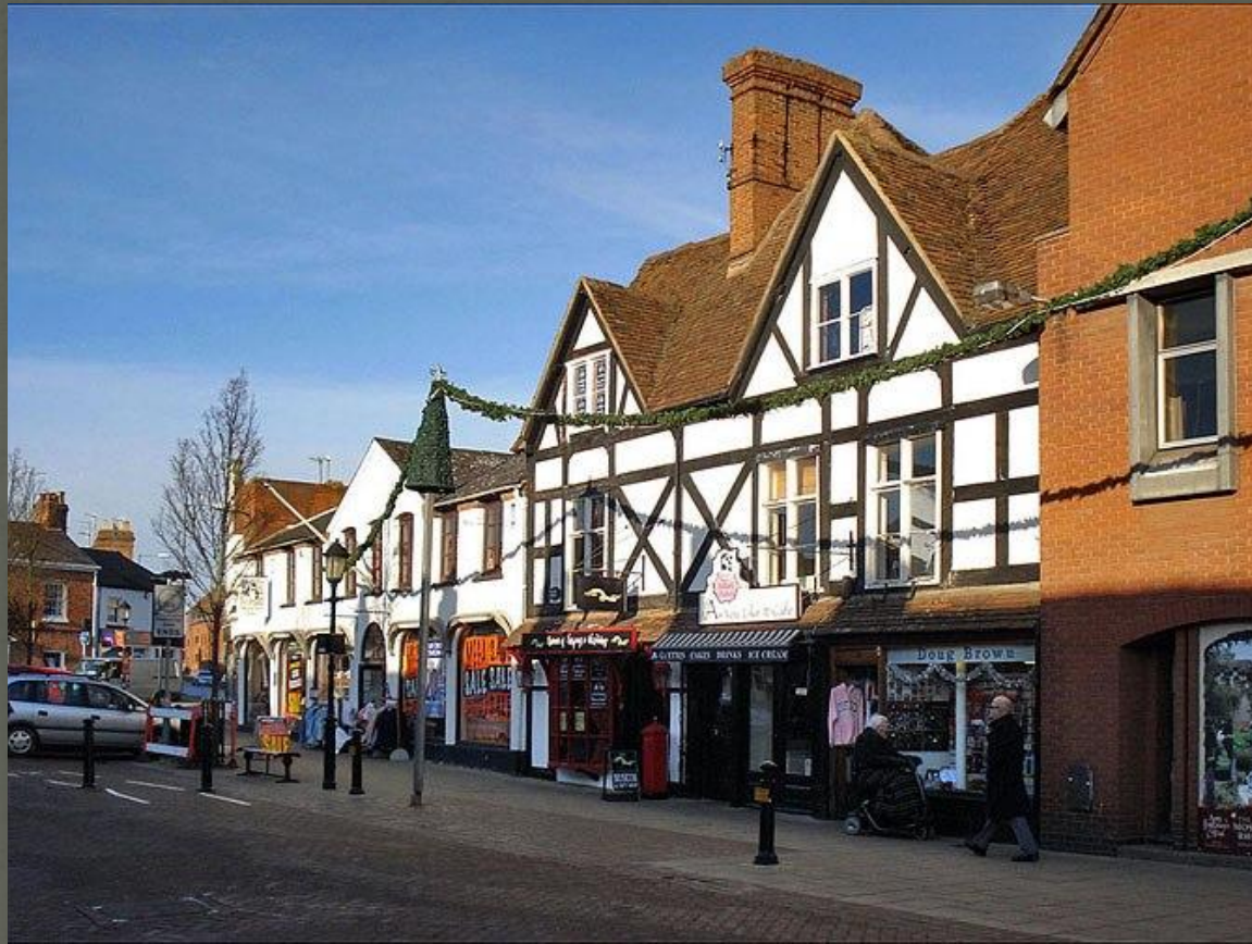
Shakespeare's birthplace in Henley Street.