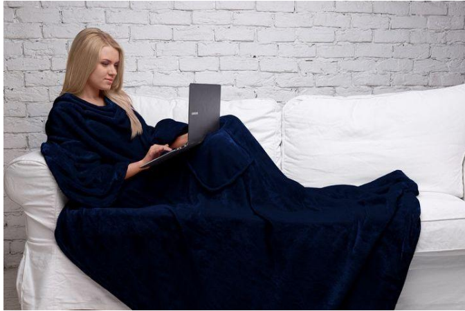
Blankie with sleeves