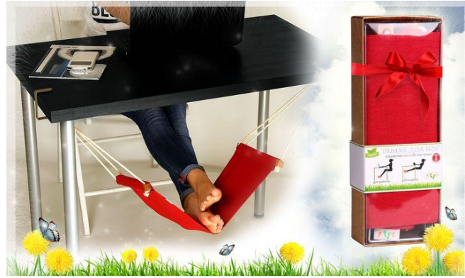
Hammock for feet