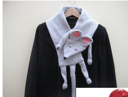
Mouse scarf mittens,gloves