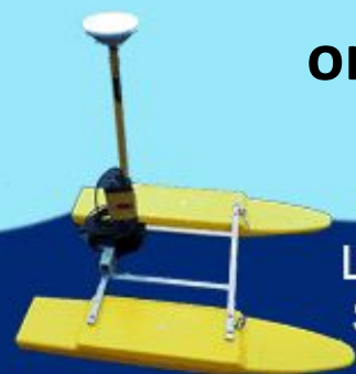
Low-Frequency Sonar Platform

One of the most famous cases of damage caused by noise pollution to nature are the numerous situations in which dolphins and whales were thrown to the shore, losing orientation due to the loud sounds of military sonars.