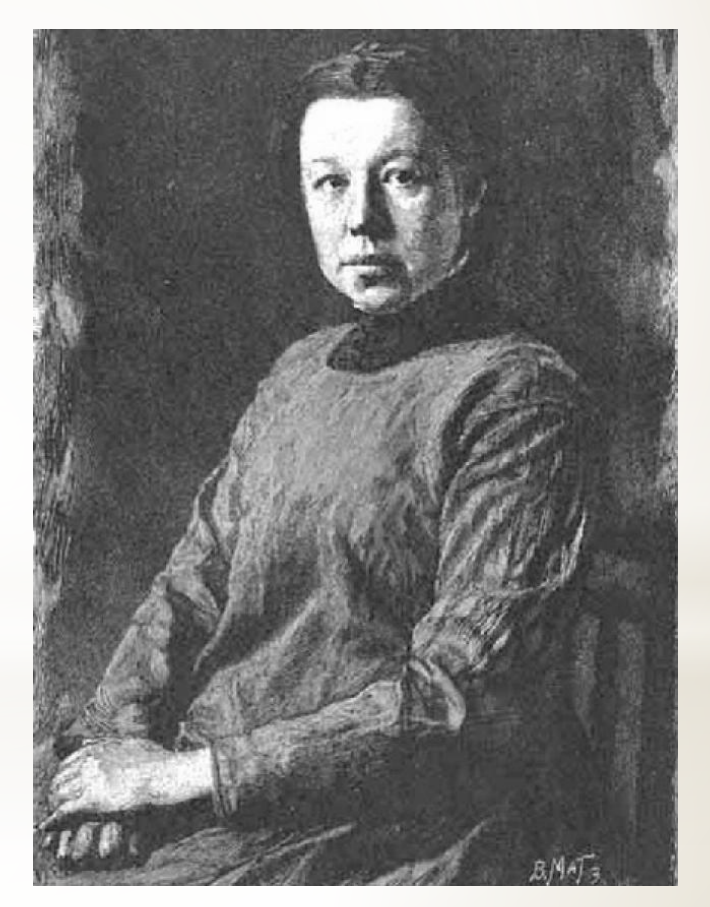
Elena Dmitrievna Polenova