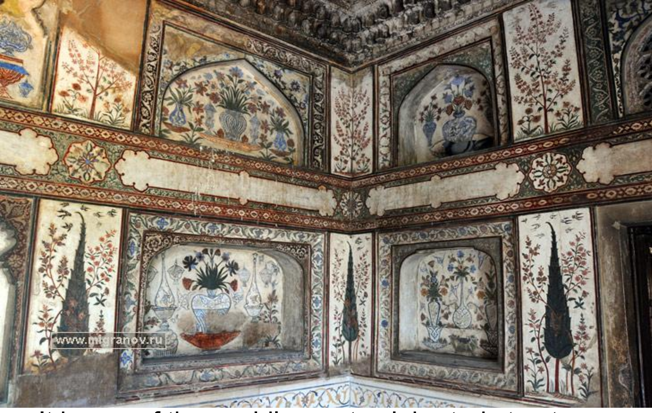
It is one of the world's most celebrated structures and a symbol of India's rich history.