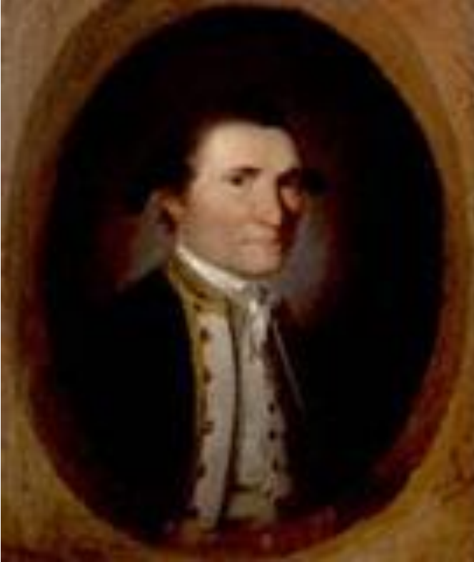
Portrait of Captain James Cook, by John Webber

Cook was an 18th century explorer and navigator whose achievements in mapping the Pacific, New Zealand and Australia radically changed western perceptions of world geography. As one of the very few men in the 18th century navy to rise through the ranks, Cook was particularly sympathetic to the needs of ordinary sailors.