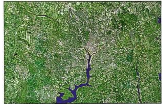
WASHINGTON D.C. FROM SPACE