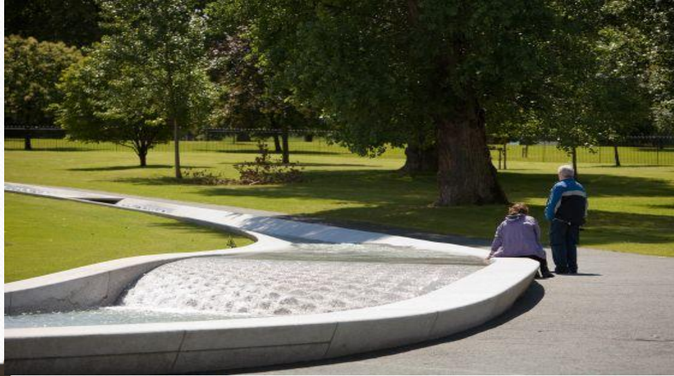
Diana Memorial Fountain