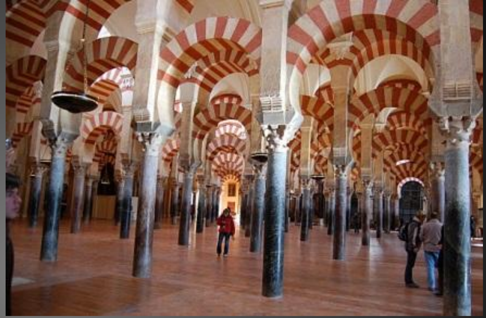
Mezquita-catedral de Córdoba