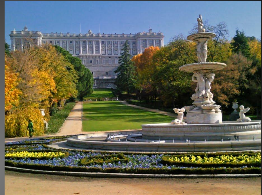
Palacio Real de Oriente. Madrid.