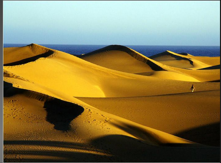
Dunas de Maspalomas