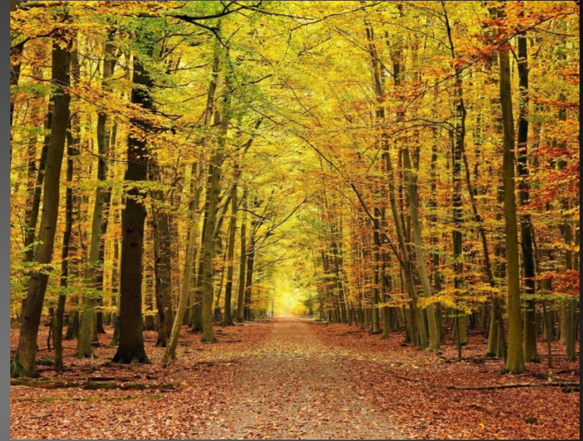
Bosque de Irati