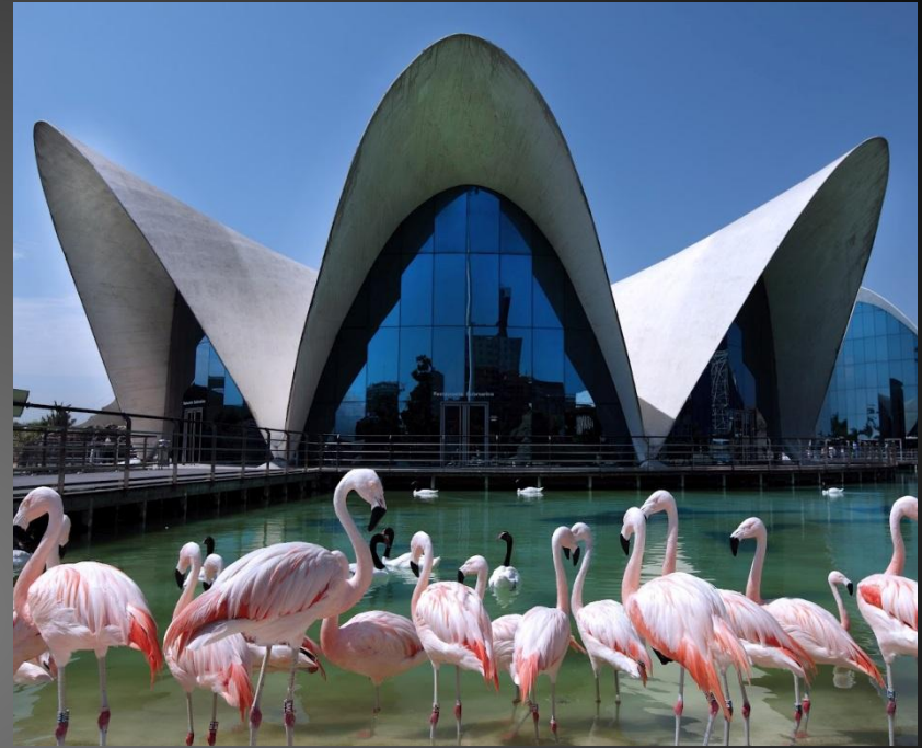
Ciudad de las Artes y las Ciencias. Valencia.