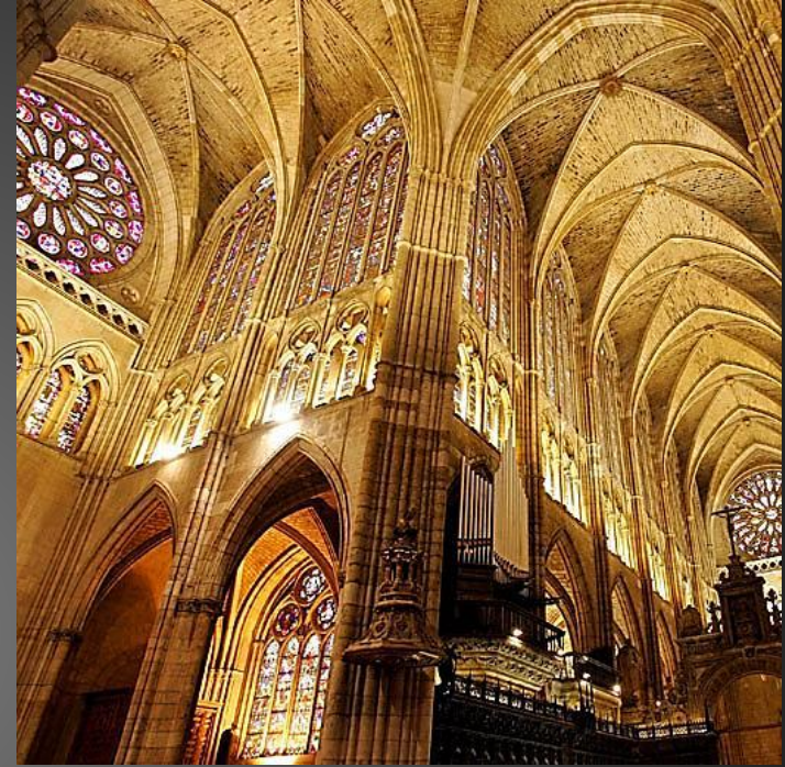
Catedral de León