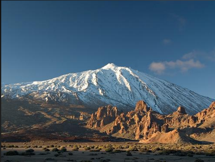
Parque Nacional del Teide