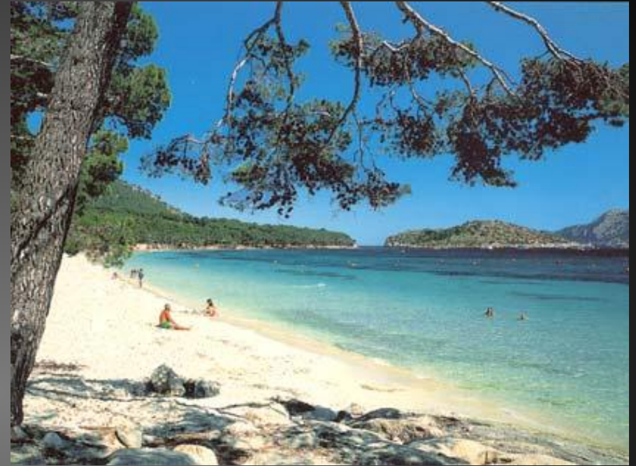
Playas de la isla de Mallorca