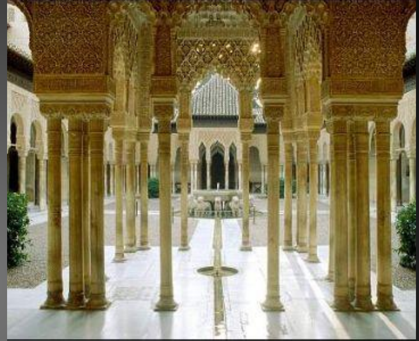
Palacio de La Alhambra