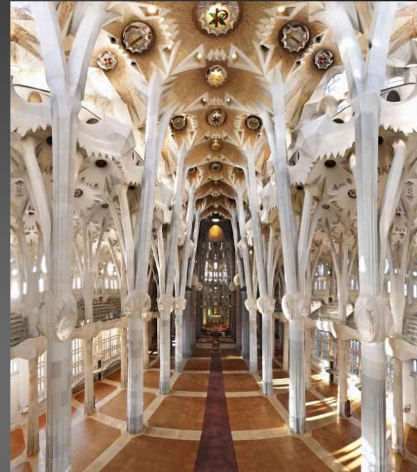
Basílica de la Sagrada Familia.