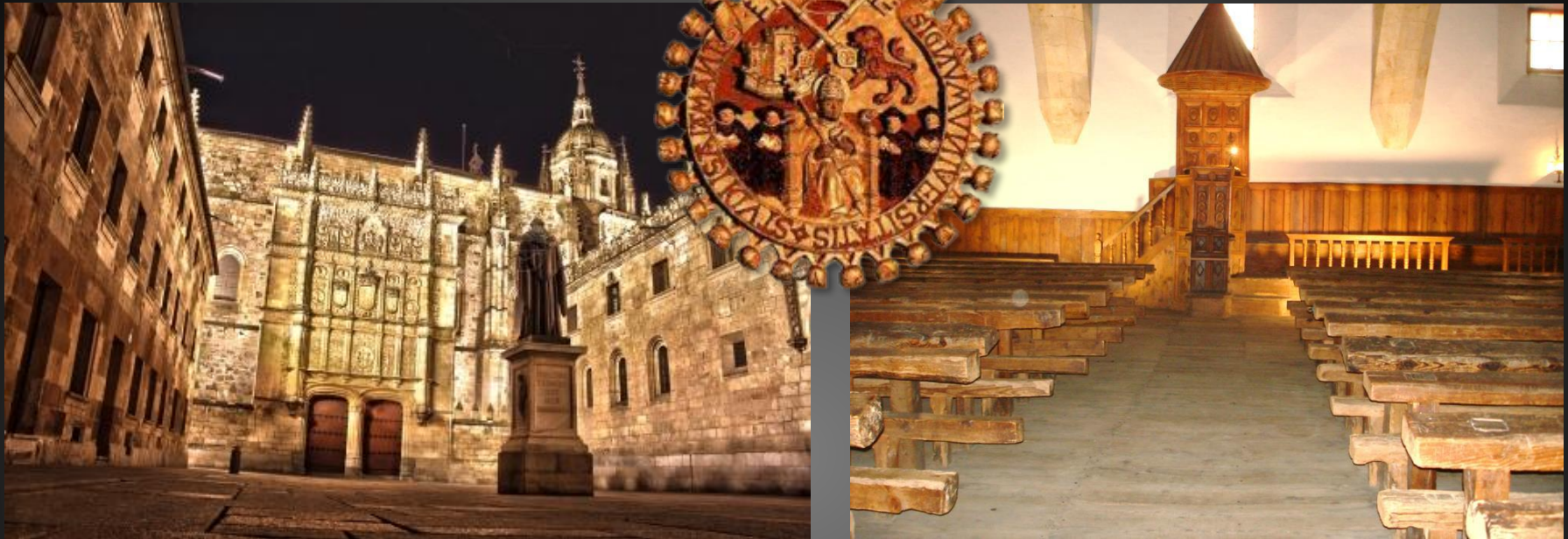
Universidad de Salamanca.