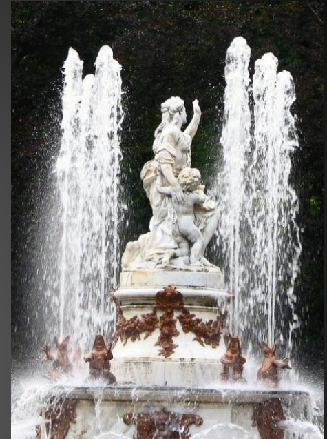
Palacio Real de La Granja. Segovia.