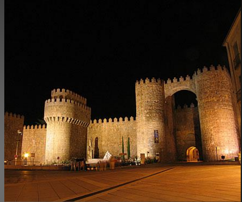
Murallas de Ávila