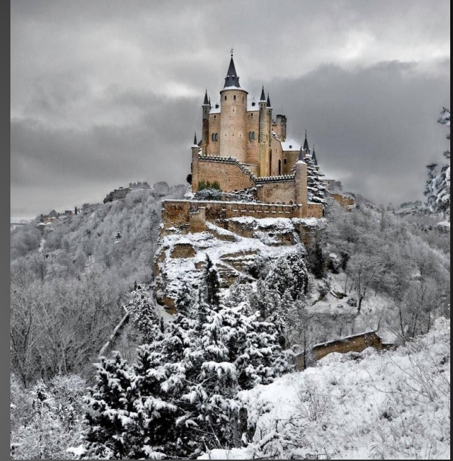
Alcázar de Segovia