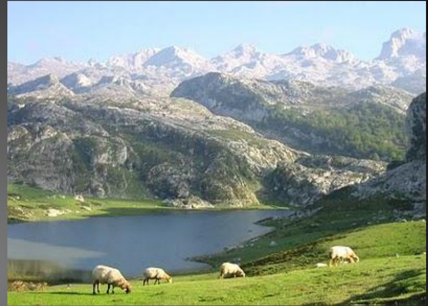
Parque Nacional de los Picos de Europa