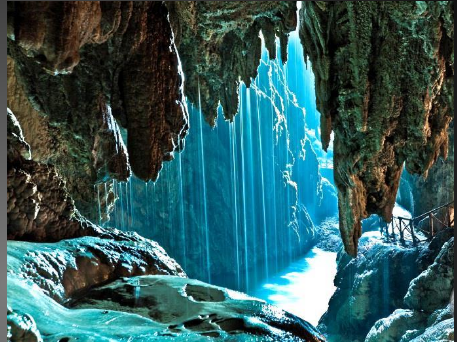
Monasterio de Piedra