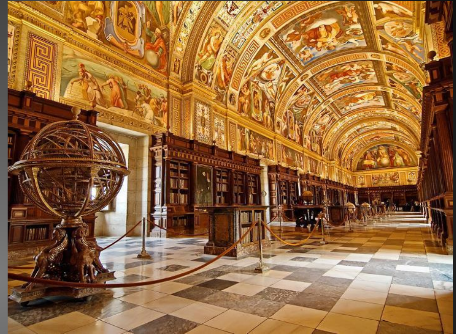
Monasterio de El Escorial.