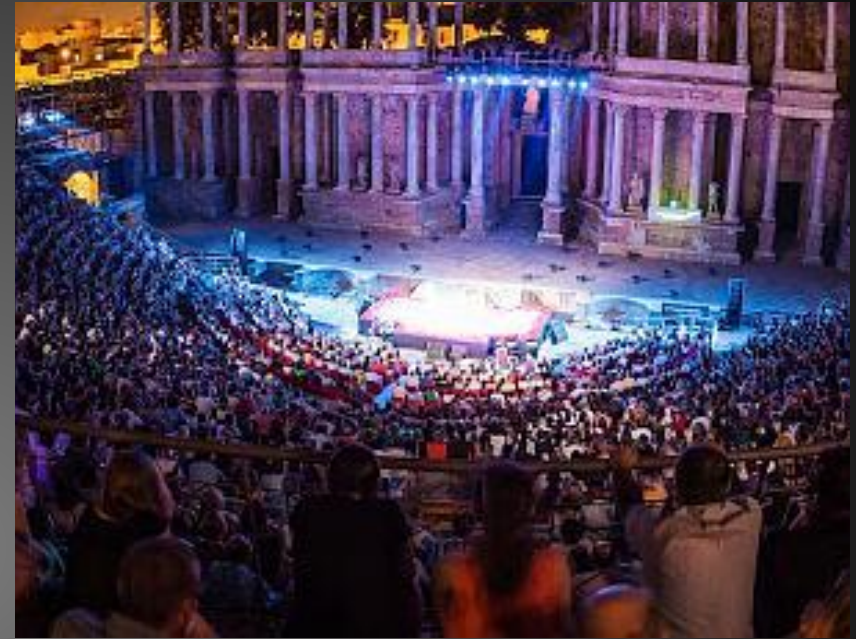
Teatro romano de Mérida