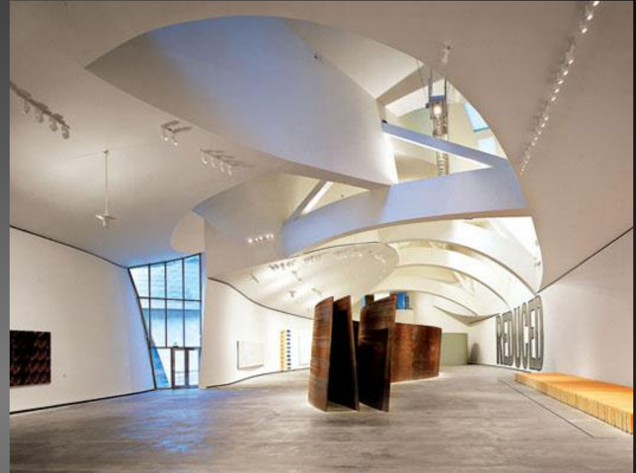
Museo Guggenheim Bilbao