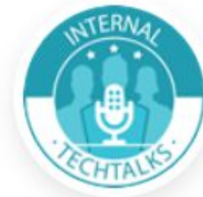
Internal Tech Talk Speaker