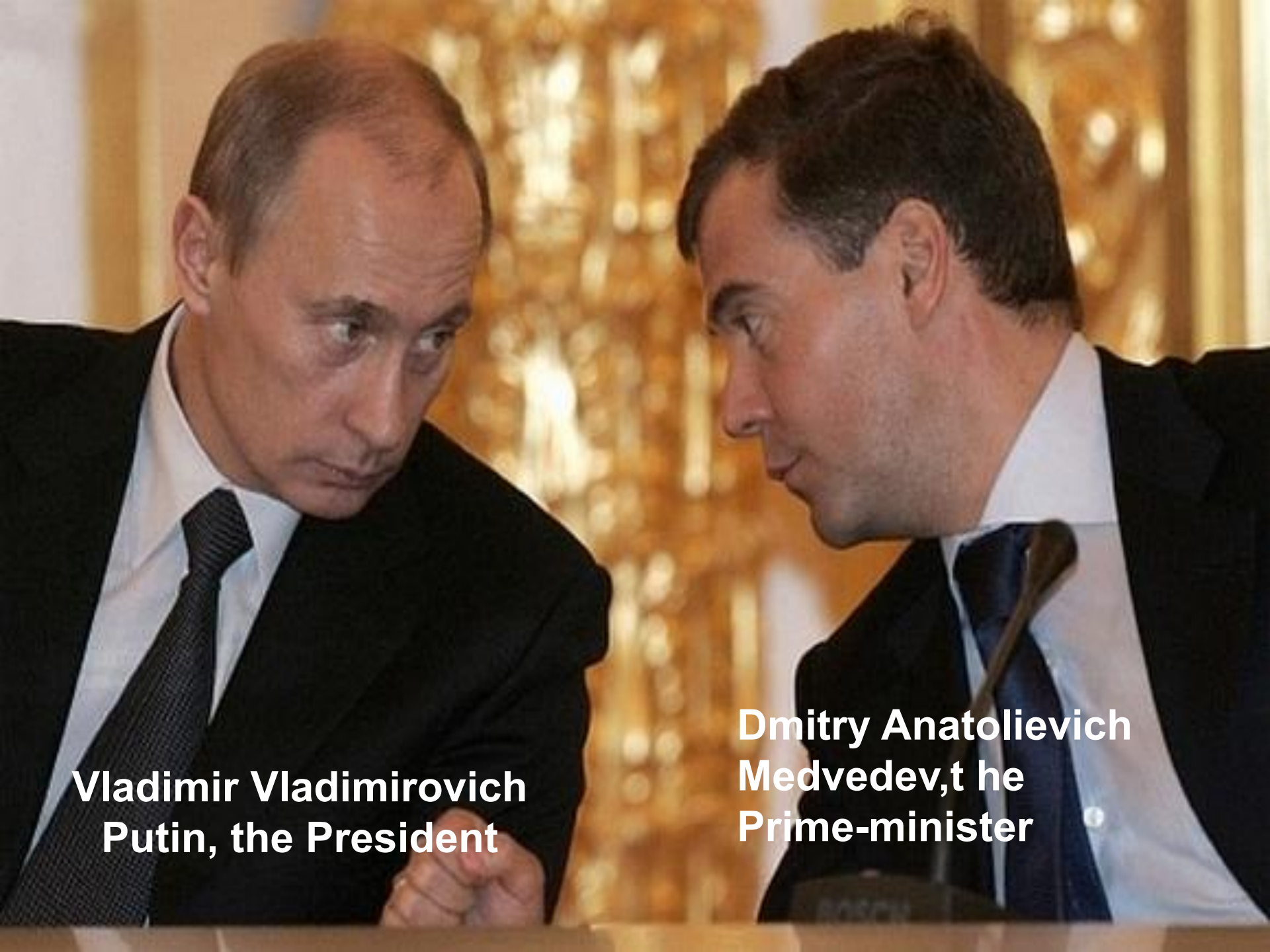
Vladimir Vladimirovich Putin, the President