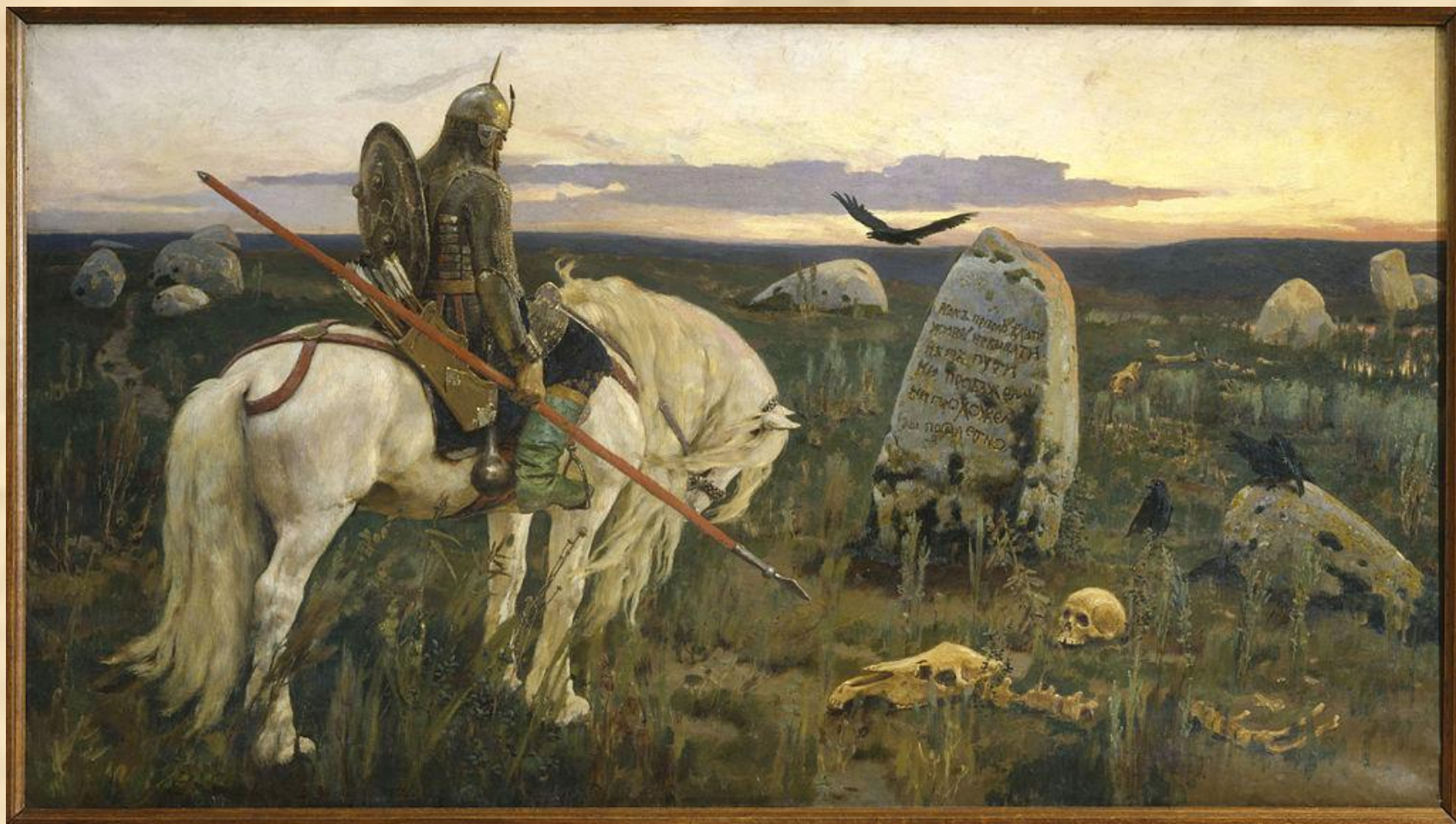
Victor Vasnetsov, Knight at the Crossroads (1882) «Витязь на распутье»