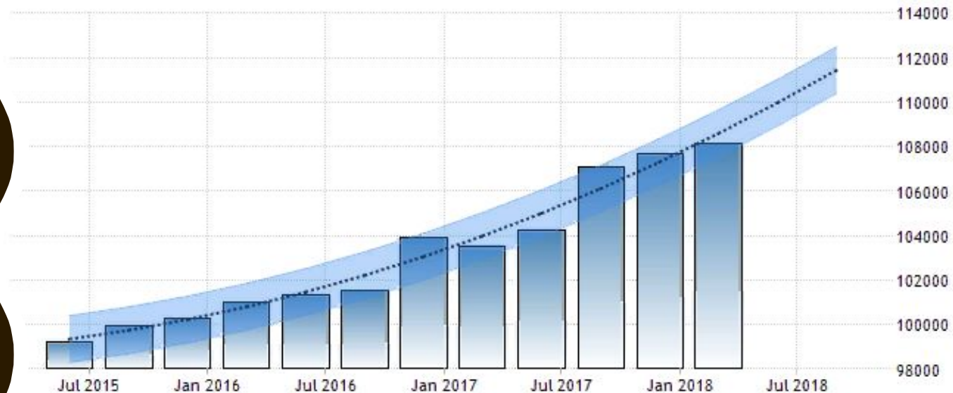
SINGAPORE GDP CONSTANT PRICES