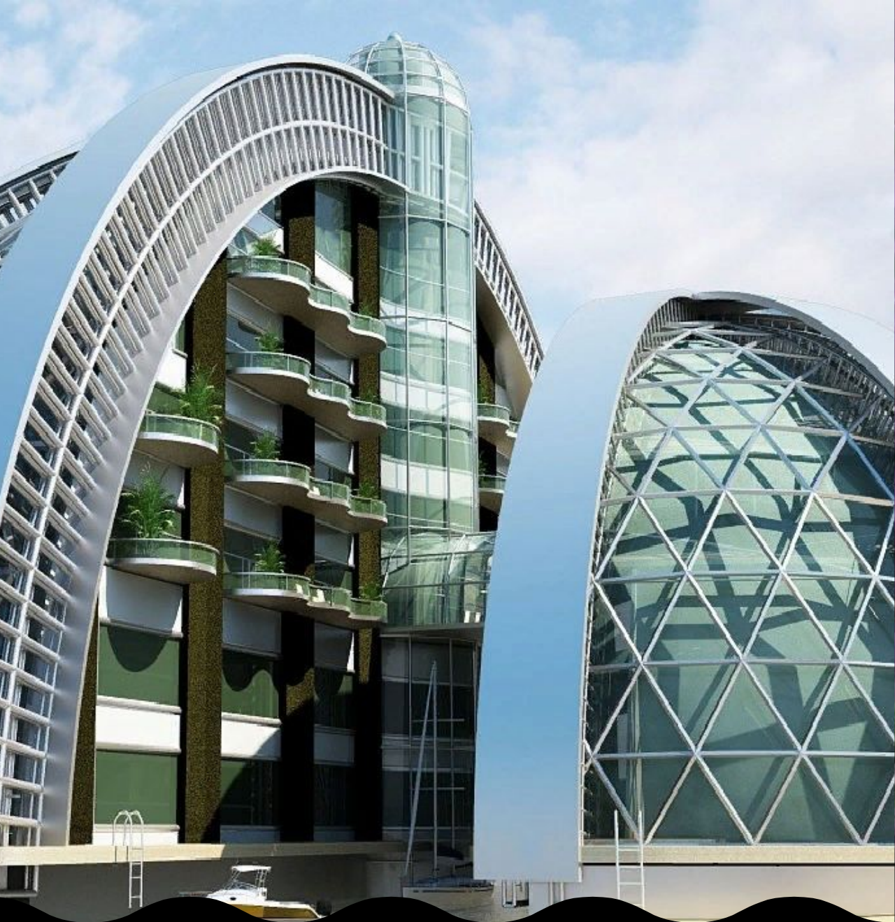
Singapore's first indoor soil-based vegetable farm