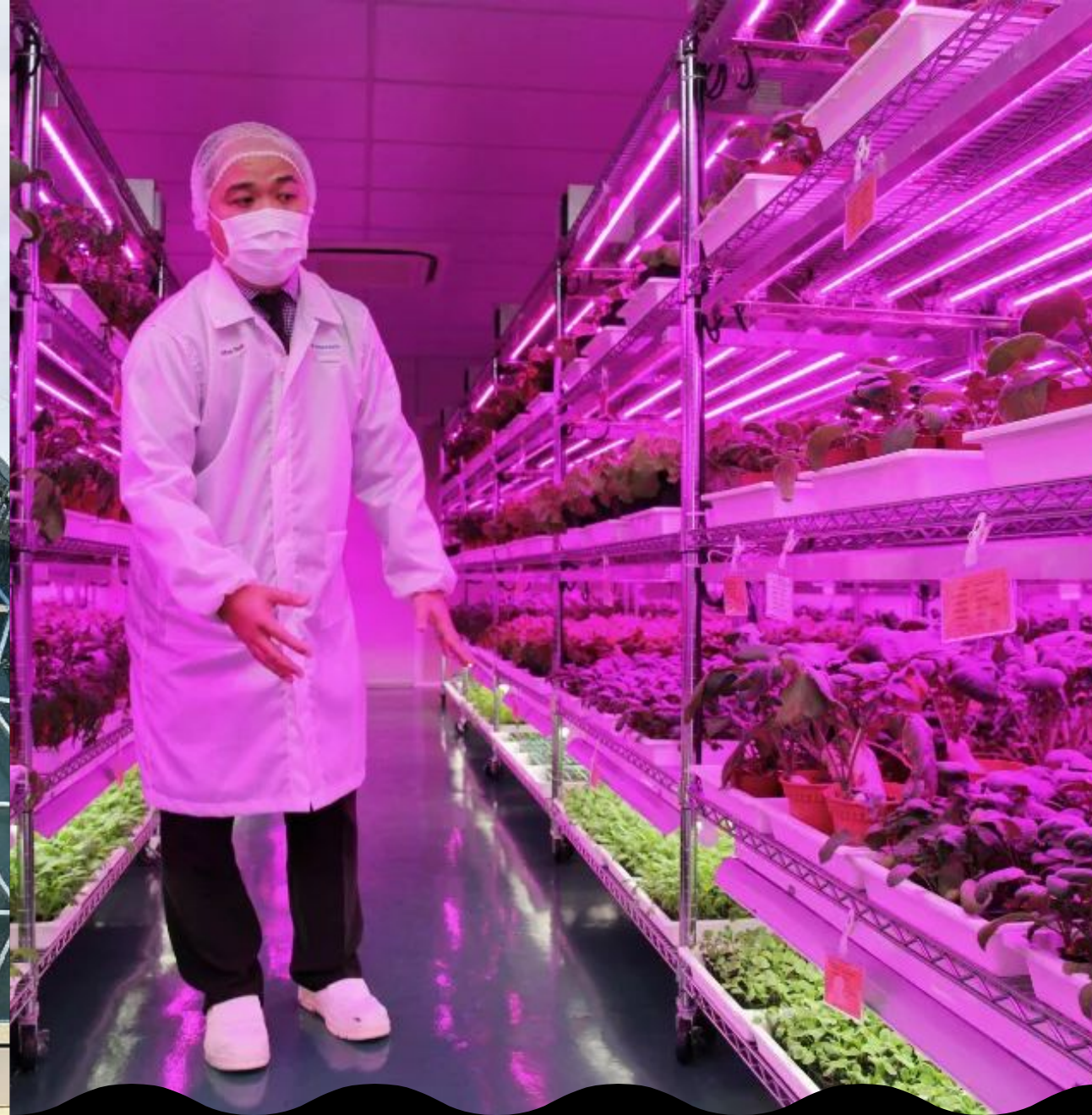
High-tech in architecture