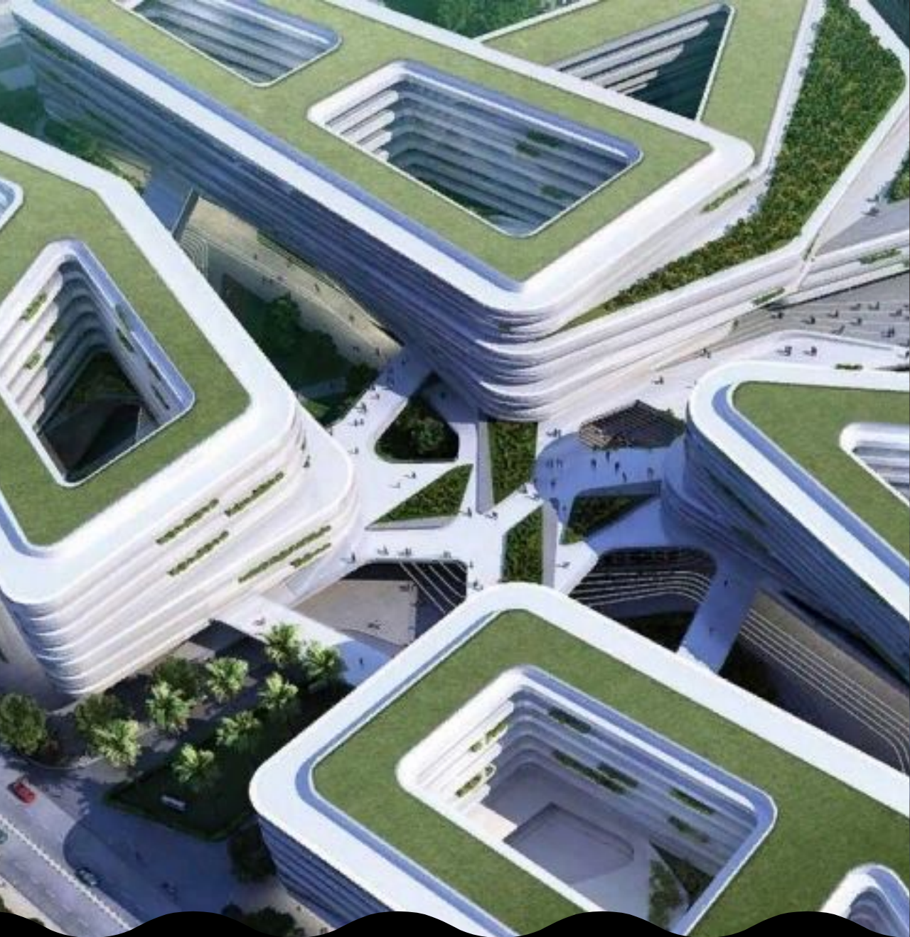
Campus of Singapore University of Technology and Design