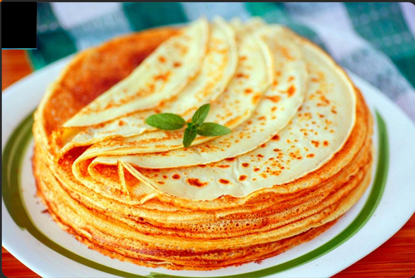
Photo of blini