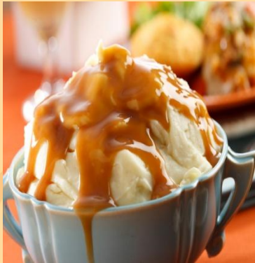
Mashed Potatoes and Gravy