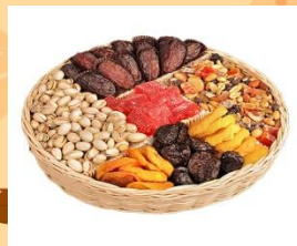
Fruits and Nuts

Click on the words to see each kind of food the Pilgrims and Wampanoag ate.