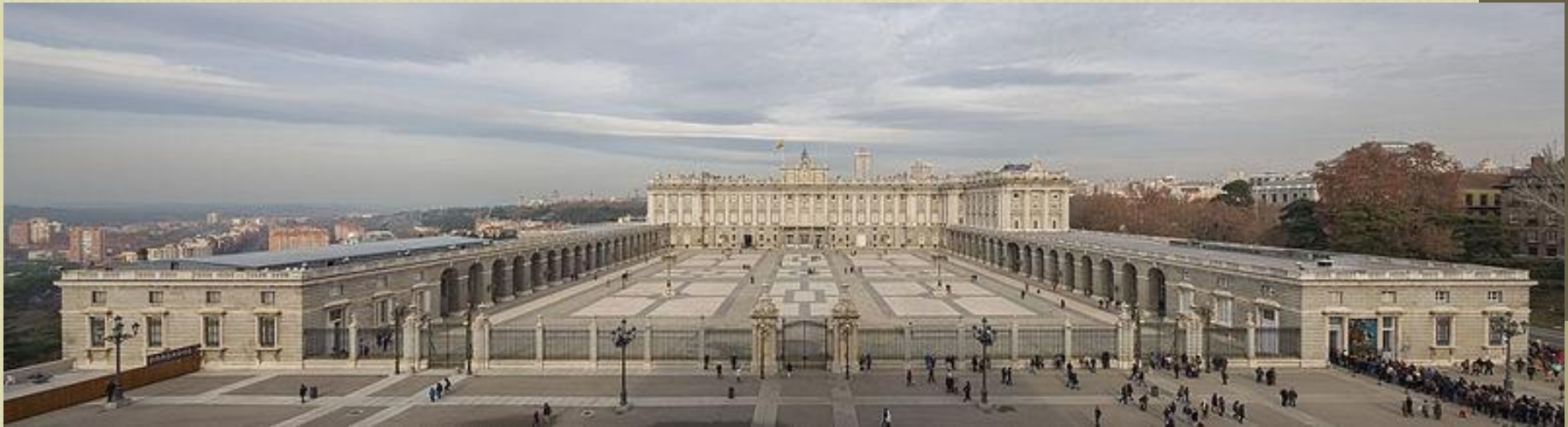
Royal Palace of Madrid