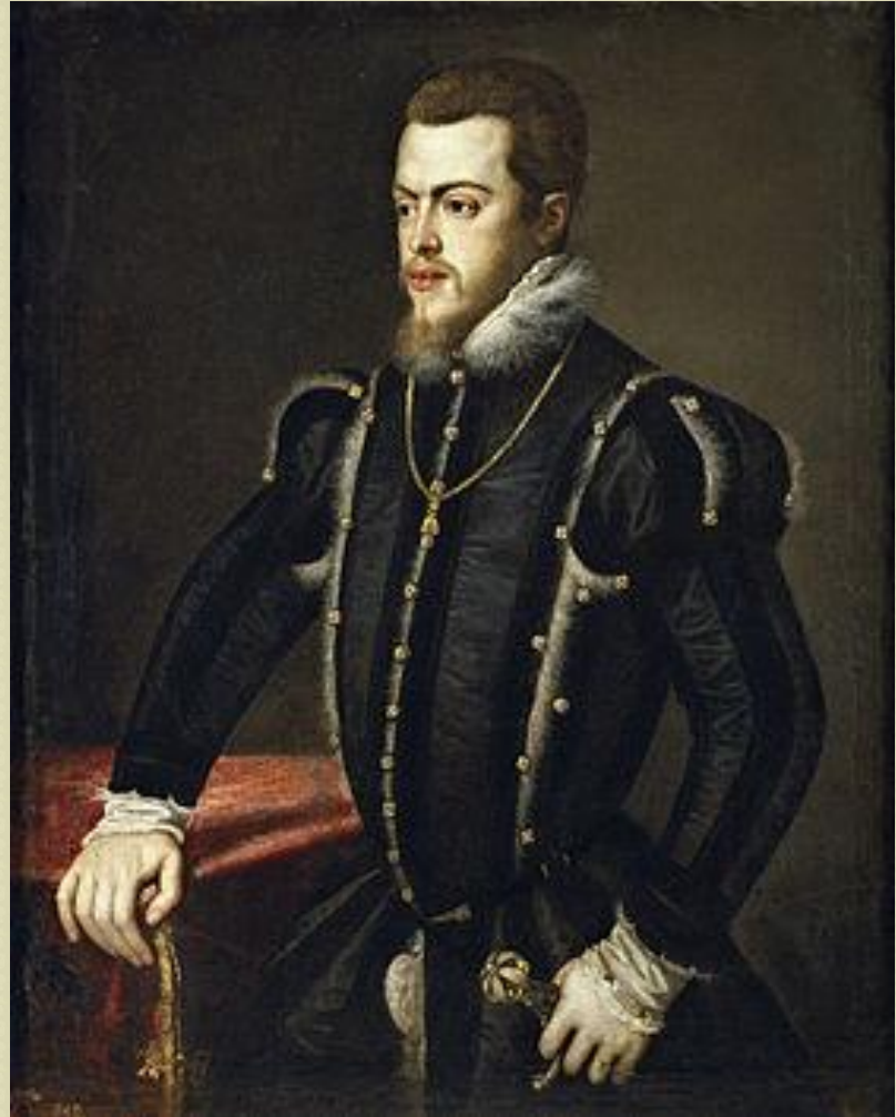
Spanish: Felipe II ; 21 May 1527 – 13 September 1598

King Phillip II made a growing city the capital of his Kingdom in 1561.