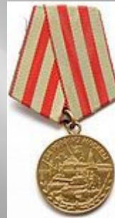
For The Defence Of Moscow За оборону Москвы