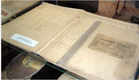
Class register from School # 201 in Moscow