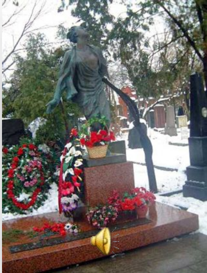
Statue at grave site at Novodevichy Cemetery in Moscow