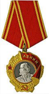
Order Of Lenin Орден Ленина