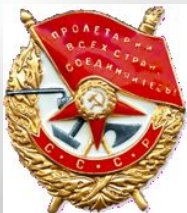
Order Of The Red Banner Орден "Красного Знамени"