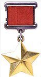
Medal "Golden Star" of The Hero of the Soviet Union Медаль "Золотая звезда"