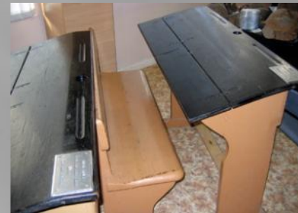
Zoya and Shura's school desk from School # 201 in Moscow