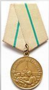
For The Defence Of Leningrad За оборону Ленинграда