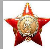
Order Of The Red Star Орден "Красная Звезда"