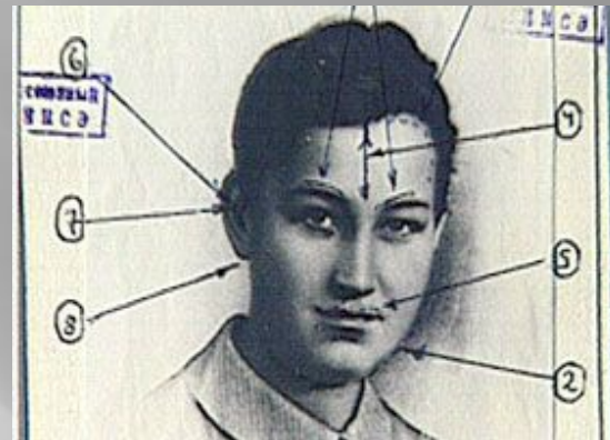
Zoya's portrait featuring markings made by the experts who proved that the young heroine "Tanya" was actually Zoya Kosmodemyanskaya