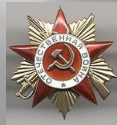
Order Of The Patriotic War (1st Class) Орден Отечественной войны (первой степени)