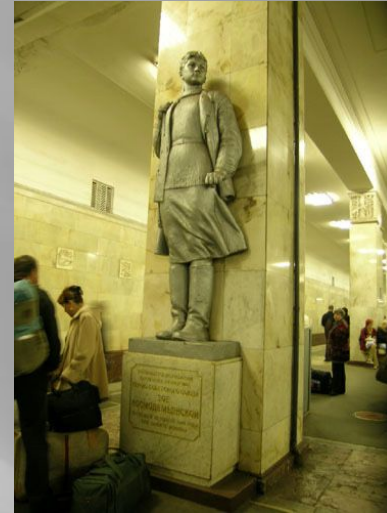
Statue at Partizanskaya Metro Station in Moscow