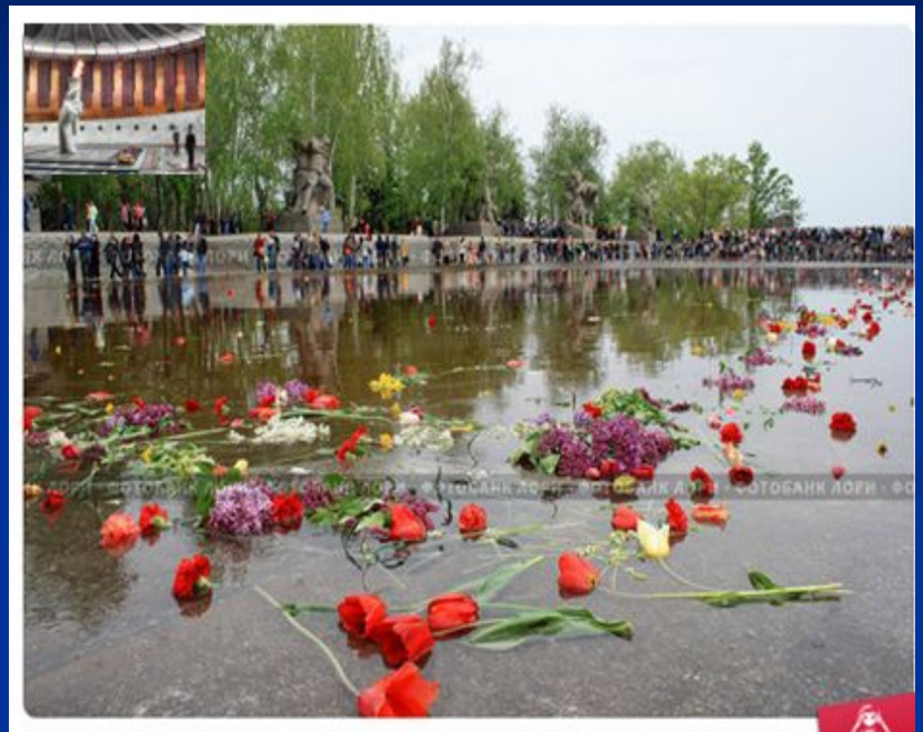
Цветы героям. Озеро слёз. Площадь Героев памятника-ансамбля на Мамаевом ю