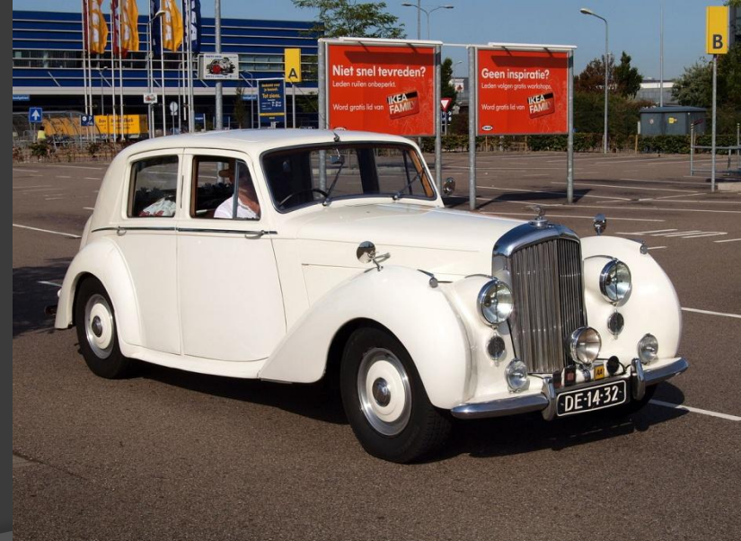
Bentley Mark VI