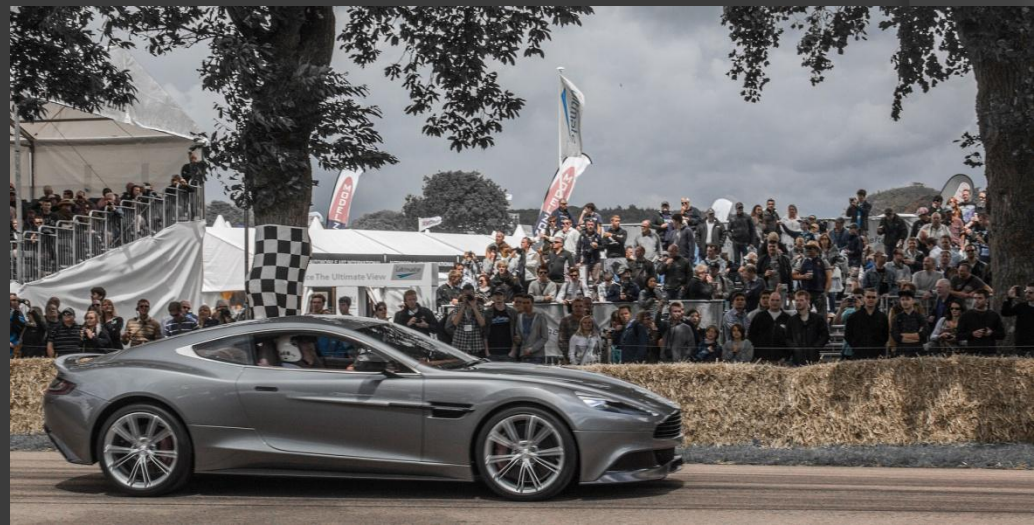
Aston Martin Vanquish 2012