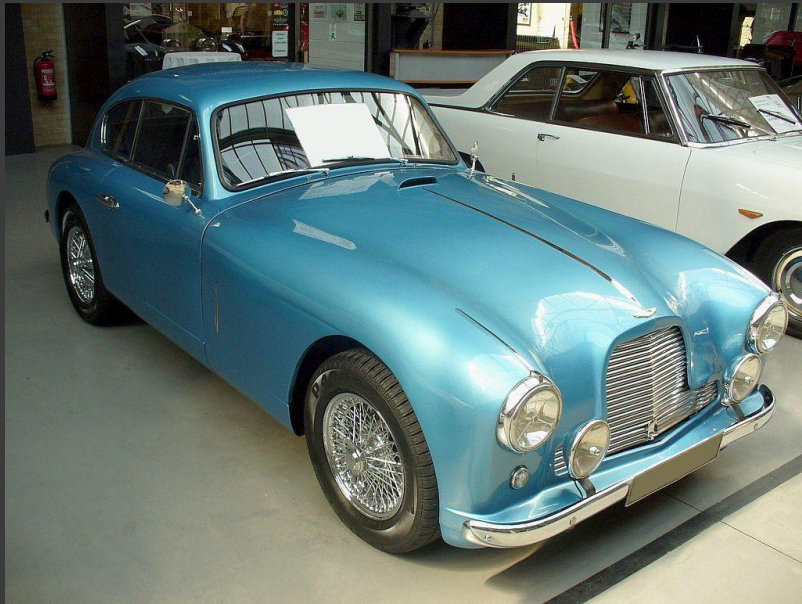
Aston Martin DB2 1950

The firm became associated with luxury grand touring cars in the 1950s and 1960s, and with the fictional character James Bond following his use of a DB Mark III model in the 1964 film Goldfinger .