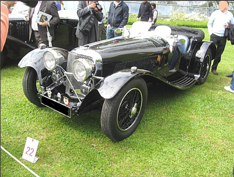
Jaguar SS 90