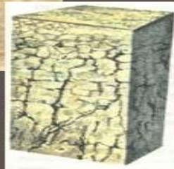
Бурые почвы пустынь и полупустынь