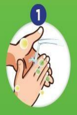
Wet your hands and apply liquid handwash