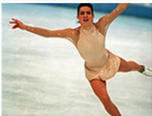
Figure skating is the oldest sport on the Olympic Winter Games programme. It was contested at the 1908 London Games and again in 1920 in Antwerp. Men's, women's, and pairs were the three events contested until 1972. Since 1976, ice dancing has been the fourth event in the programme, proving a great success.