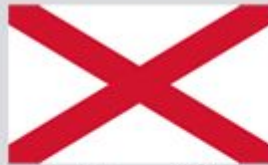
Cross Saltire of St Patrick (Ireland)