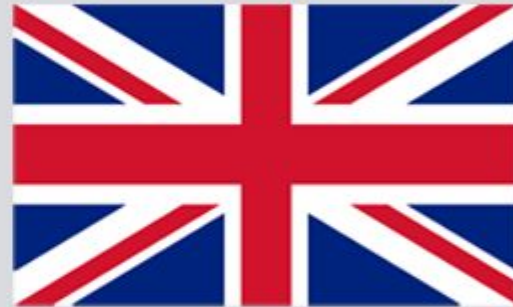
Union Jack (1801)