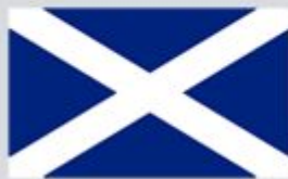
Cross Saltire of St Andrew (Scotland)