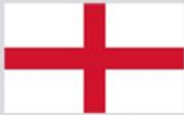
Cross of St George (England)