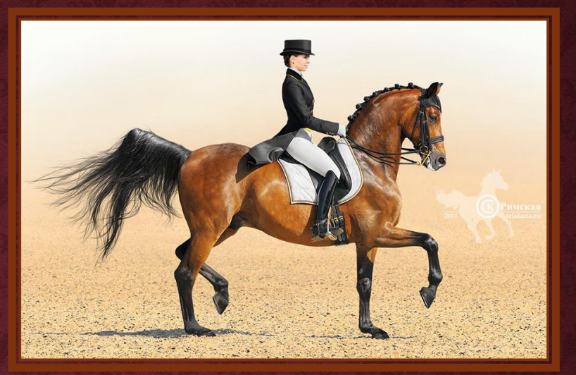
Piaffe - trot on the spot.

The highest riding school, is considered to be an Olympic sport. In the arena rider demonstrates his horse management skills, her movements and the performance level of its submission to the rider. Demonstrates piaffe, squat, stand right, smooth and rhythmic gait transitions from one to another, and the addition of a reduction of pace, pirouette, passage, half-pass sideways and others.