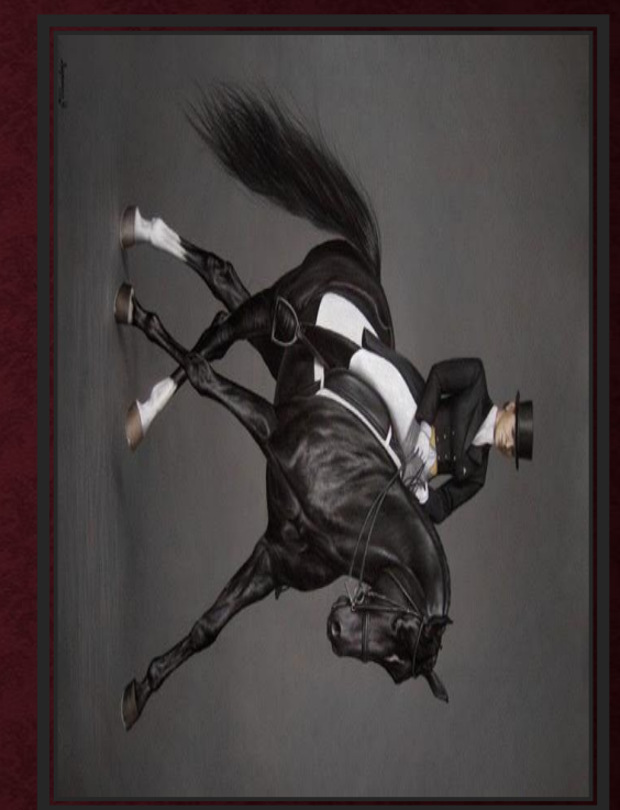
Half-pass - lateral movement trot.