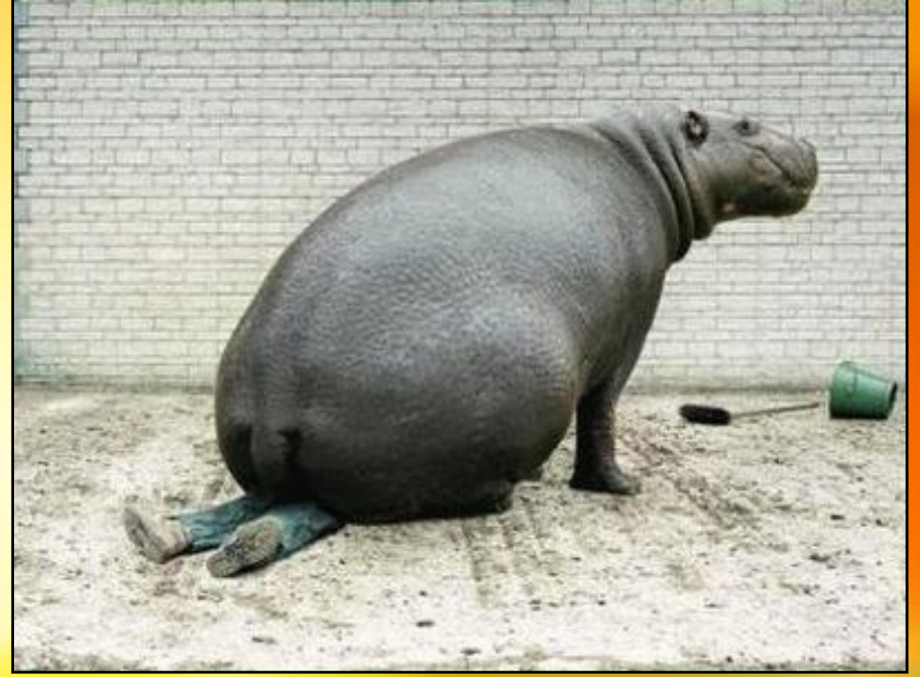
Is a hippo dancing? No, it isn`t. It is sitting on a man man