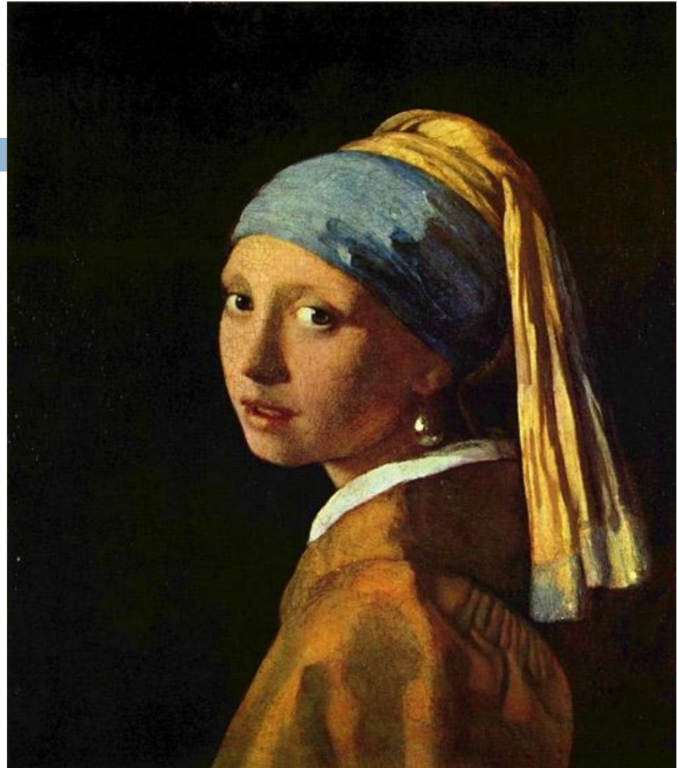
Jan Vermeer "The girl with a pearl earring" 1665.