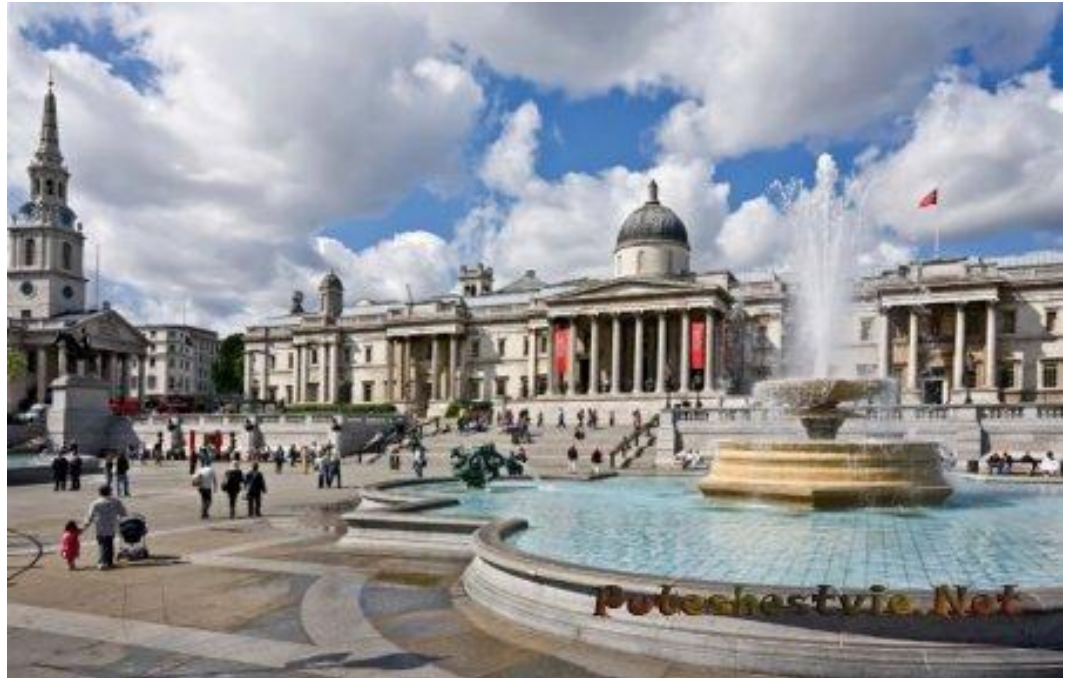
Pinacoteca di Brera

The largest and most famous art gallery in Milan. Opened in 1809, the collection includes paintings by European artists XV-XVII centuries and masterpieces of Italian artists XIV-XIX centuries: Raphael, Caravaggio, Modigliani, Bramante, Tintoretto and others.