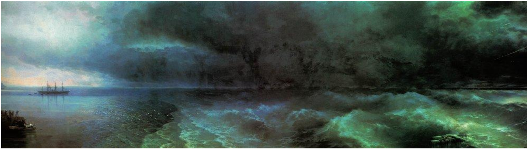
“From calm to hurricane” 1892 year. Ivan Aivazovsky