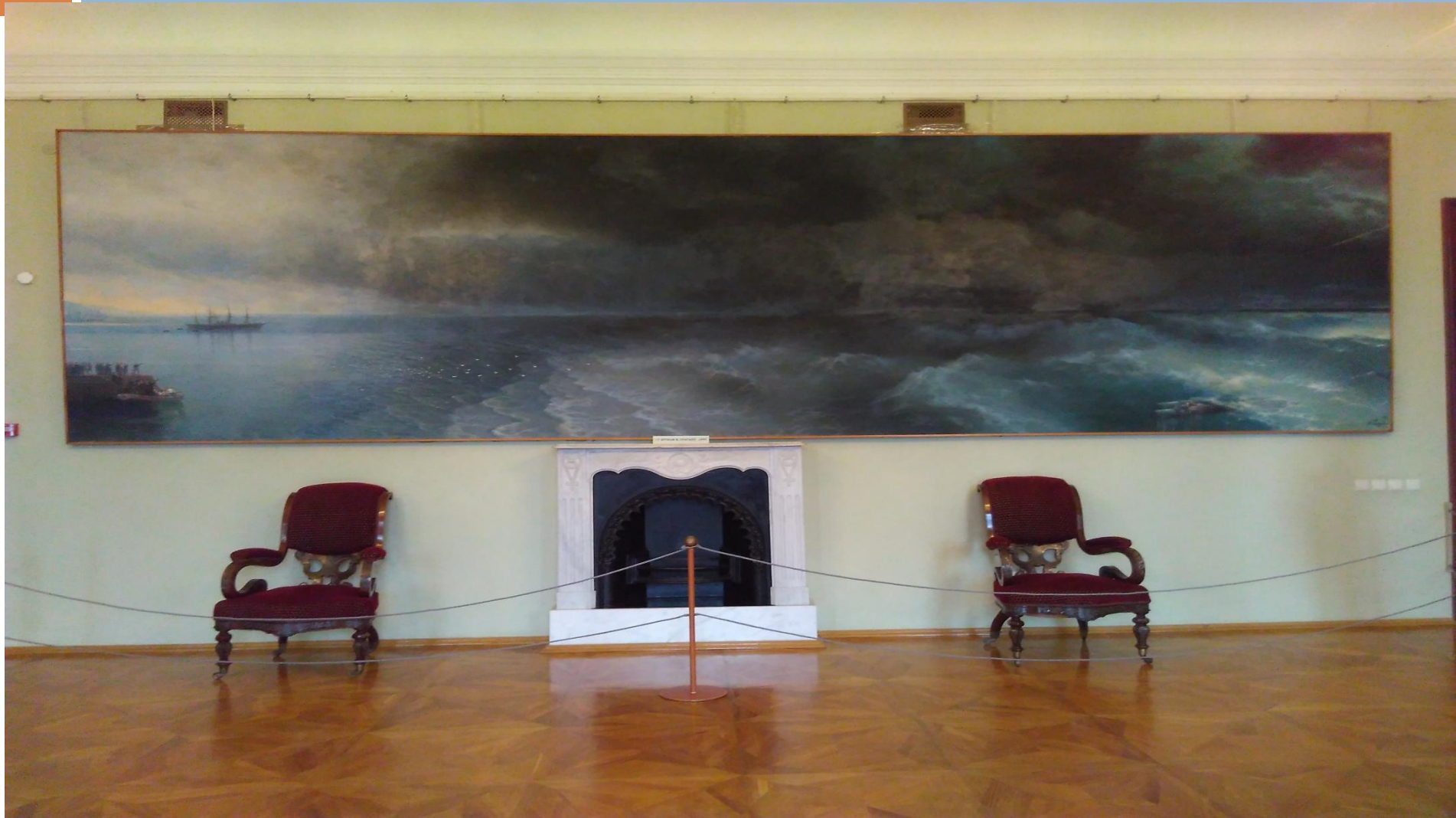
Photo from the gallery in Feodosia.