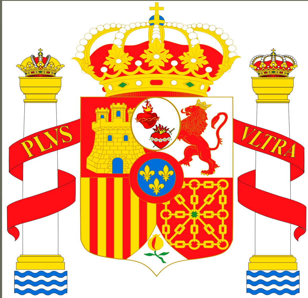
The coat of arms of Spain