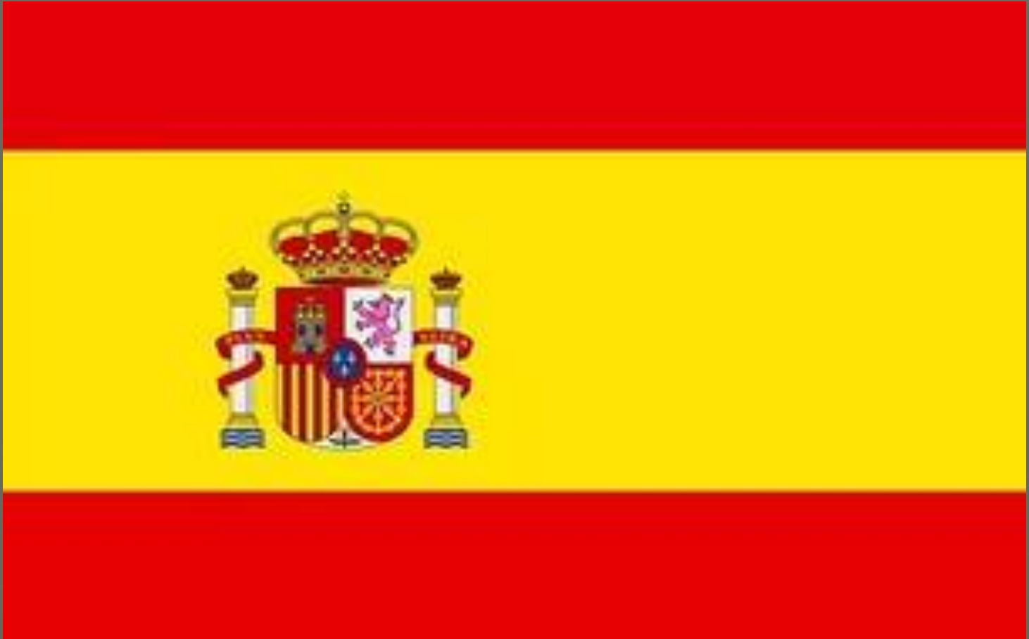
The flag of Spain