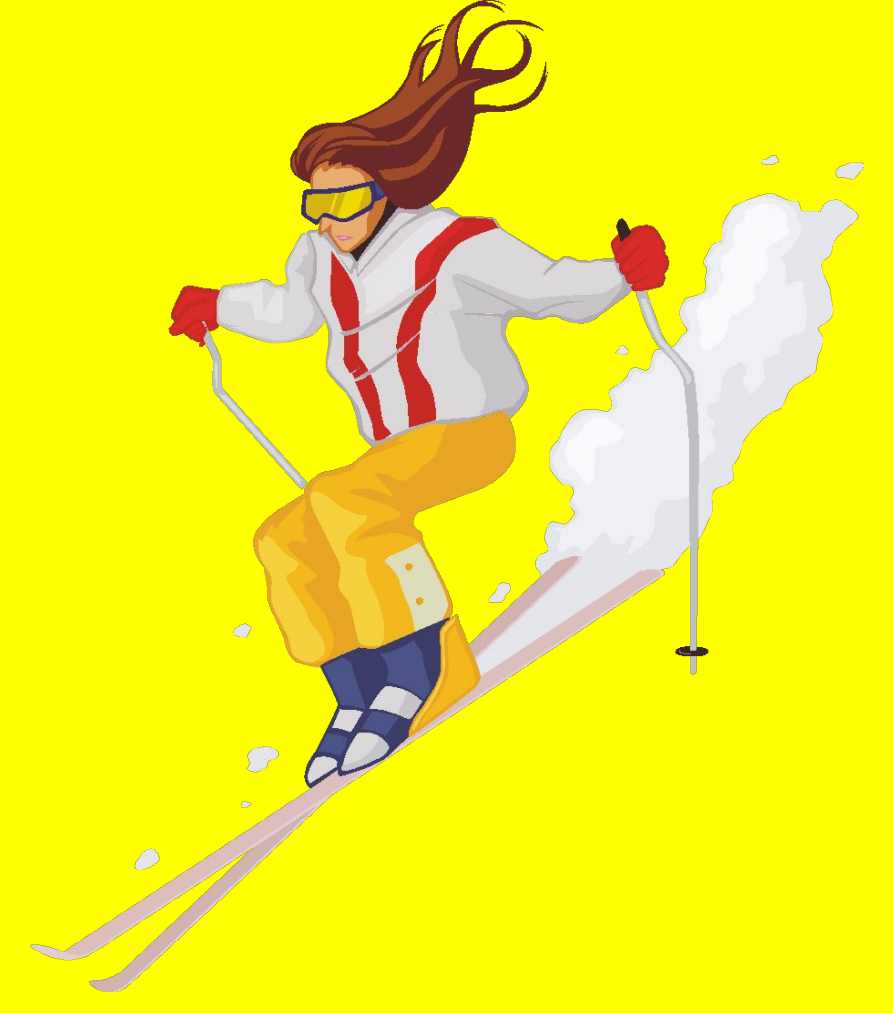
SHE ____WAS SKIING-__ (SKI) WHEN THE AVALANCHE ___STARTED___ (START).