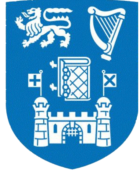
Queen Elizabeth I