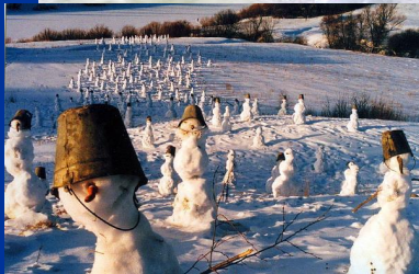
Make a snowman