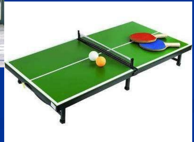
Play table tennis