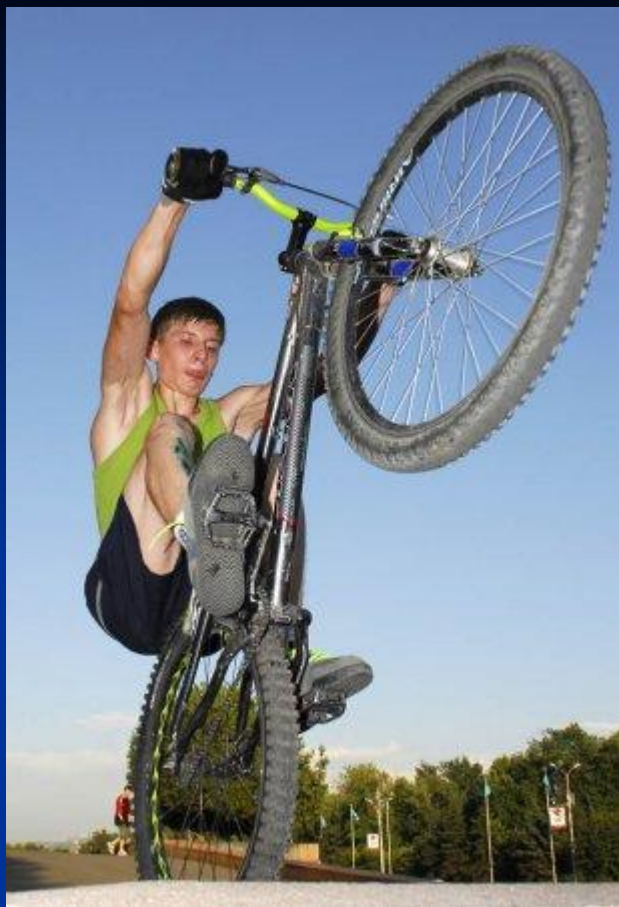
Ride a bike