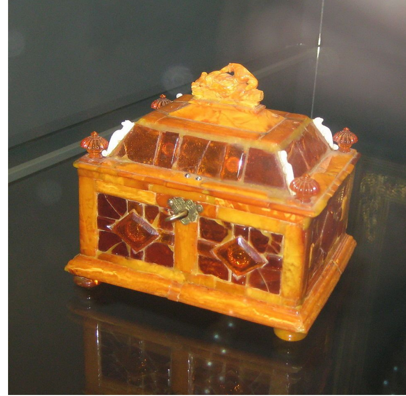
Casket. It was presented by Friedrich Wilhelm I to Peter the great during his stay in Berlin in 1716.