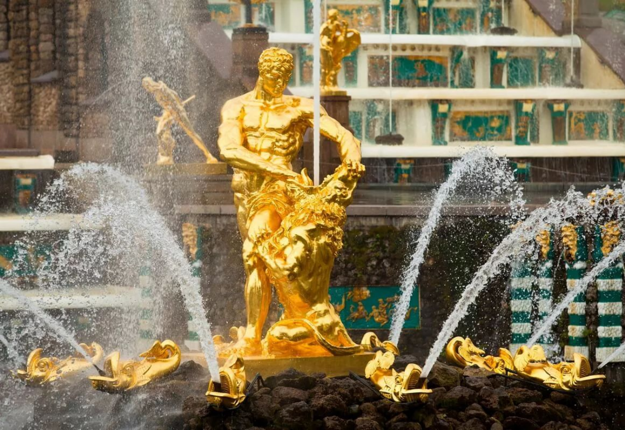
Figure of Samson tearing the lion's mouth