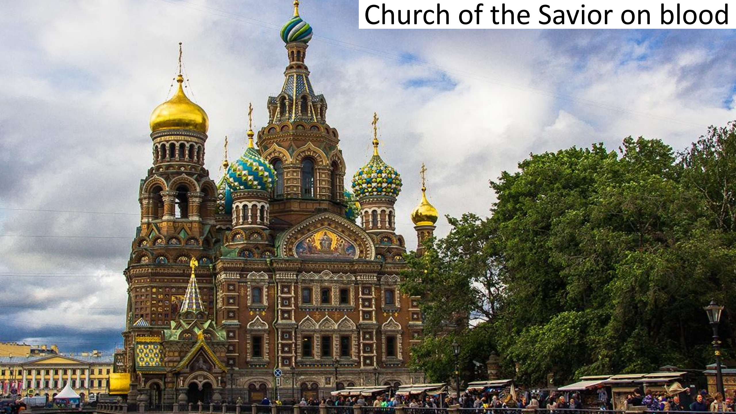
Church of the Savior on blood