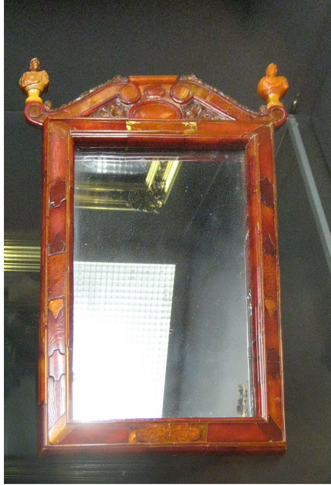
Mirror. It was donated by Friedrich Wilhelm I to Peter the great during his stay in Berlin in 1716.