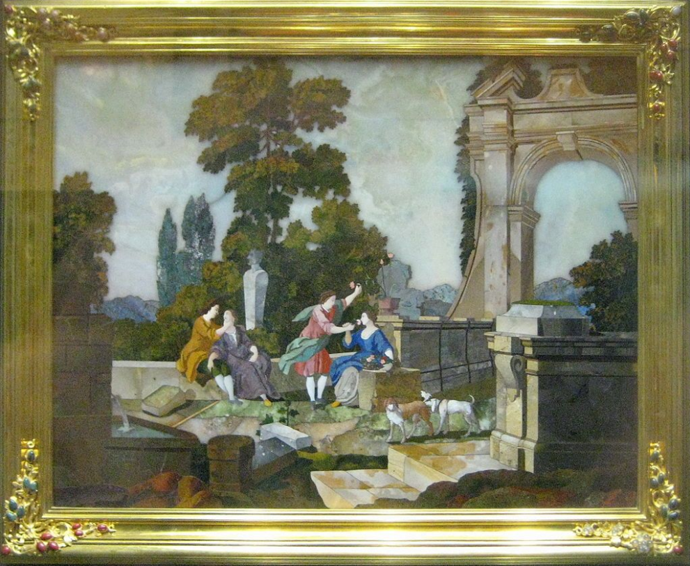
Mosaic Picture "Touch and Smell". Italy, 1751.