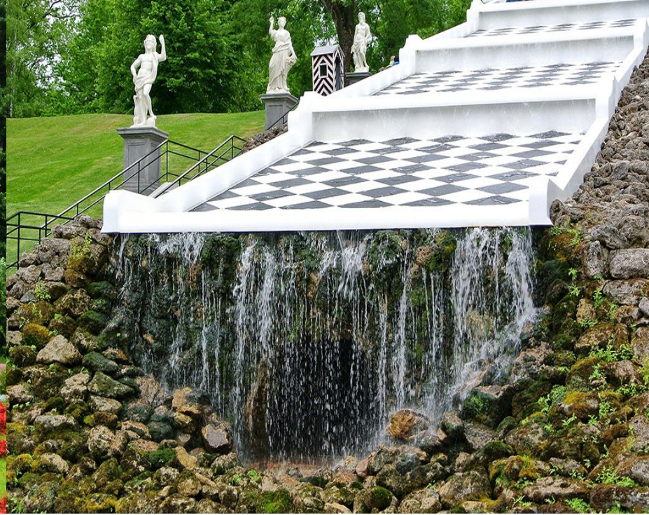
Cascade "Chess mountain"