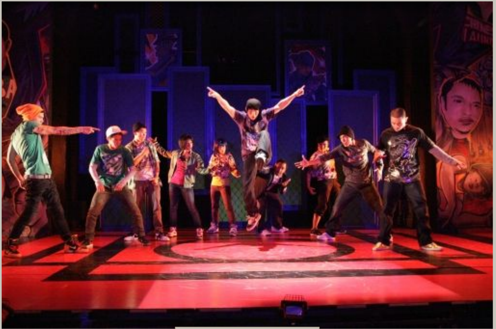
East West Players