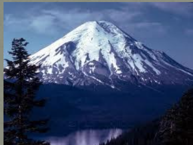
...a big mountain”