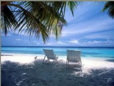
...a beautiful beach”