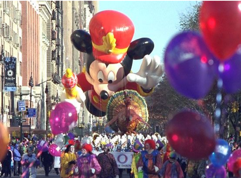
MACY'S PARADE IN NEW-YORK.