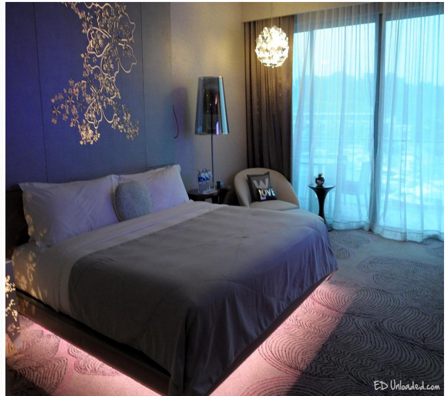
❑ Fashionable suite