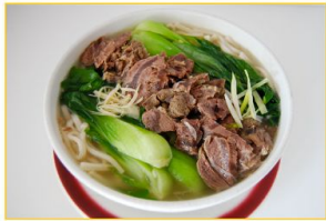
清炖牛肉面 Beef Noodle Soup $7.00