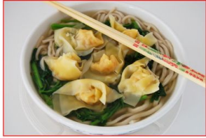
玻璃馄饨 Chinese Wonton Noodle Soup $5.50