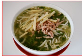
雪菜肉丝面 Shredded Pork & Snow Cabbage Noodle Soup $7.00

图片仅供参考 Actual presentation of dishes will vary from pictures