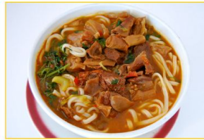
川味牛腩面 *Szechuan Beef Noodle Soup $7.00