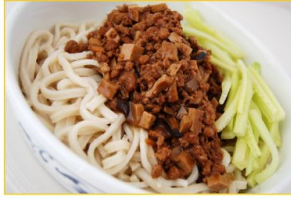
炸酱面 Ja Jang Mein $5.95