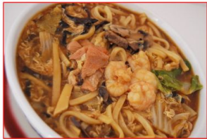
大卤面 Da Ru Mein $7.00