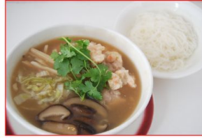
肉梗米粉 Rou Geng Noodle Soup $6.95