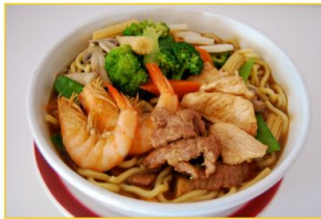
三鲜汤面 Triple Delight Noodle Soup $7.00