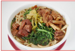
红烧牛腩面 Beef Brisket Noodle Soup $7.00