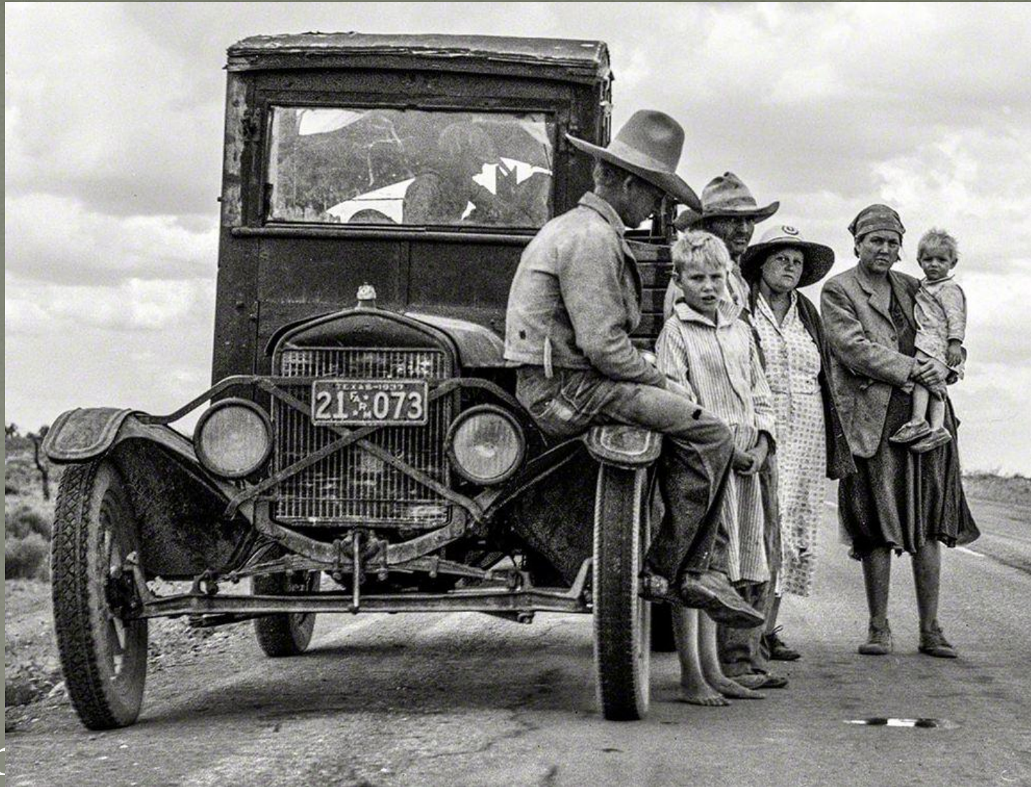
During the Road of Flight for farm families escaping the Dust Bowl