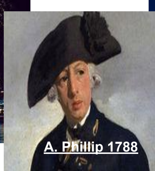
A. Phillip 1788