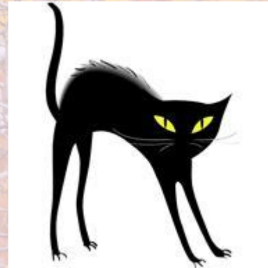
A BLACK CAT