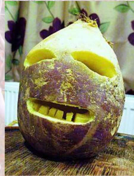
Modern Jack-o'-Lantern made from a turnip.

On Halloween boys and girls put on old and funny clothes. People put pumpkins on the window-sills. They cut eyes, noses and mouths in the pumpkins. Then they put candles into them. So the pumpkin looks like a face.