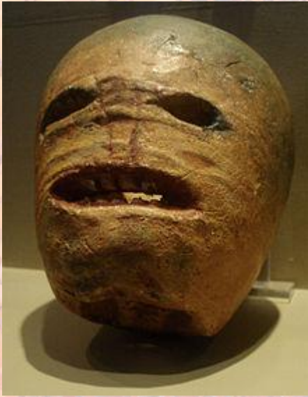
A traditional Irish Jack-o'-Lantern in the Museum of Ireland.