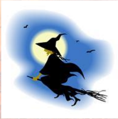
A WITCH ON A BROOM