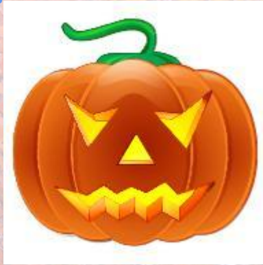
A SMILING JACK OR JACK' O' LANTERN