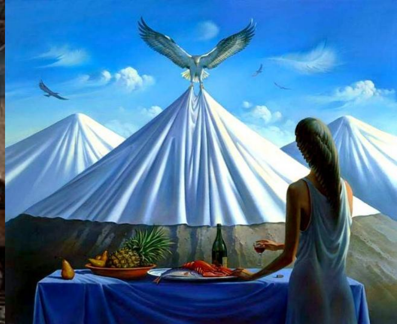
Works of Salvador Dali