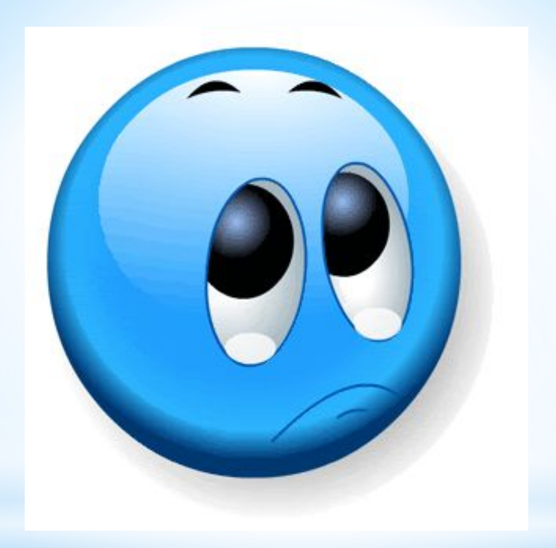
He is sad